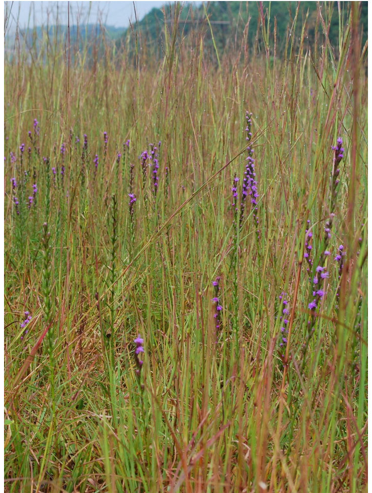
Shaggy blazingstars blooming in a field of little bluestem.

Some plant species are particularly successful in the anthropogenic meadows of Maryland's Coastal Plain. Anthropogenic meadows are areas that lack the tree cover typical of the Eastern Deciduous Forest because of human activity. Examples can be seen along roadsides, under utility lines, or where pastures or crop fields have been abandoned. The meadow species that thrive in these areas are well adapted to human disturbance and require