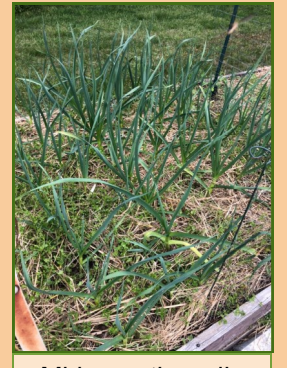
Mid-growth garlic plants mulched with 2-3" of straw.

If you have other questions about my experiences growing garlic, contact me at scccrgal@yahoo.com.