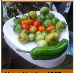
Vegetables from VICPark raised garden beds

REFERENCES - https://extension.illinois.edu/blogs/live-well-eat-well/2021-05-19-eat-radish-top-bottom https://www.canr.msu.edu/news/radish variety can add flavor and crunch to your meals