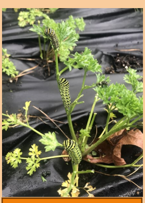
Black Swallowtail Caterpillars

Article and photos by CC MG Terry Thir, Melwood Project Leader