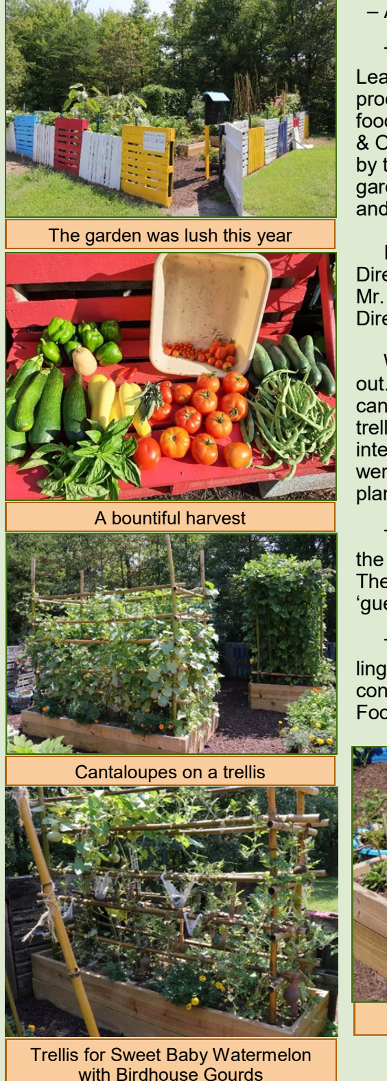
– A SUCCESSFUL YEAR! –

The Southern Maryland Food Bank "Seeds of Hope" Community Learning Garden was a success this year! We harvested 379 lbs. of produce that the Food Bank distributed to families or used in their food truck operation. The Directors of Southern Maryland Food Bank & Outreach Services were quite pleased with the support provided by the Charles County Master Gardeners in redoing the entire garden infrastructure this year, producing such a bountiful harvest, and assisting in their garden outreach activities.