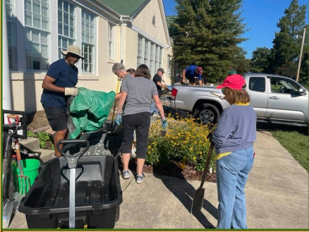
CC MGs building the Bay-Wise river bed

Article and photos by CC MG Kathy Jenkins