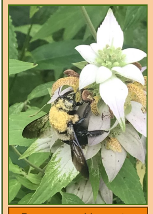
Bee covered in nectar

As the summer is passing us by, so are all of the beautiful butterflies, birds and insects. This summer our pollinator garden reached maturity. Our plants averaged around 4 feet tall and were full of beautiful flowers. We were visited by so many varieties of butterflies, birds and beneficial bees.