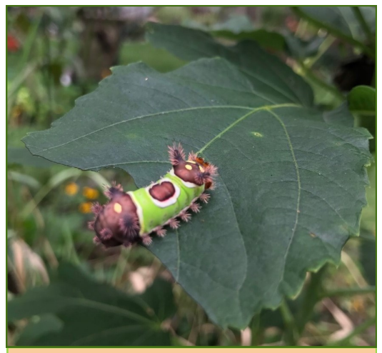
Saddleback Caterpillar