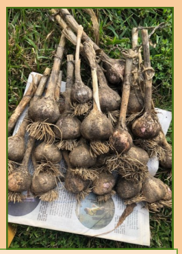
Freshly dug garlic with 4-5" of stem left w/bulb. When digging, place pitchfork 3" away from plant so as not to pierce the head. Rock tool back and forth to loosen dirt, grasp stem near soil level and gently pull.