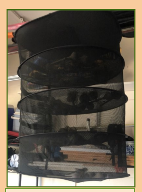
Mesh curing system hanging in my garage allowing good airflow for 2-3 weeks.