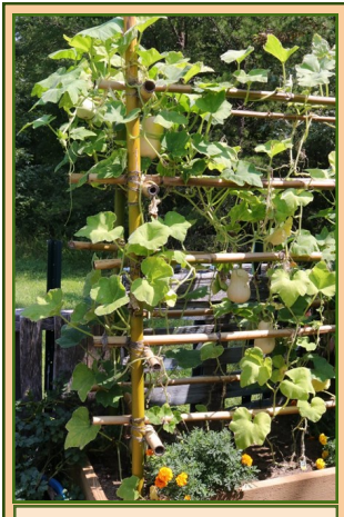
Butternut Squash grows up, not out