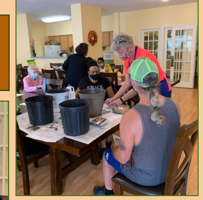
CC MGs assisted VIC Park residents with various activities. L: Indoor herb garden

In addition, CC MGs forming the SagePoint Sub-Team in cooperation with the VLT Multi-Media Team developed an educational video entitled "Succulents" for an educational activity. This session is scheduled for November for residents of this senior facility. More about this event in the January 2022 COMPOST issue. In the meantime, Happy Holidays!