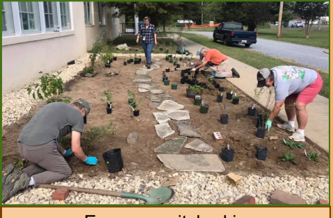
Everyone pitched in