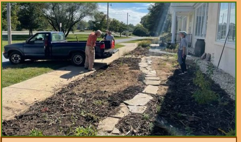
Laying the walkway in Native Pollinator Garden