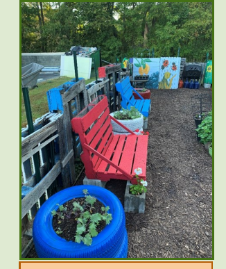
Tire planters replanted with Kale for fall