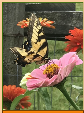
Eastern Tiger Swallowtail