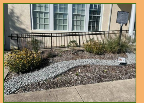
Refreshed river bed in MD Historical Garden

Now we will need to maintain these gardens as we build new ones, which are welcome tasks. We count on our members to help make this dream into a continuing reality.