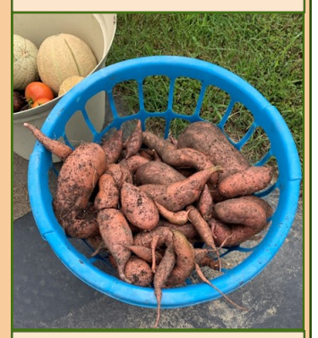
Bumper Sweet Potato harvest from one tire planter

What a successful year – and our success was all due to the many Master Gardeners and Interns who toiled long and hard this entire spring and summer! Congratulations to each one of you!