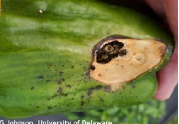
G Johnson, University of Delaware

With the recent hot temperatures and more predicted, there is high potential for sunburn in fruits and fruiting vegetables. Growers may need to consider ways to protect against sunburn. Sunburn is most prevalent on days with high temperatures, clear skies and high light radiation. We commonly see sunburn in watermelons, tomatoes, peppers, eggplants, cucumbers, apples, strawberries, and brambles (raspberries and blackberries).