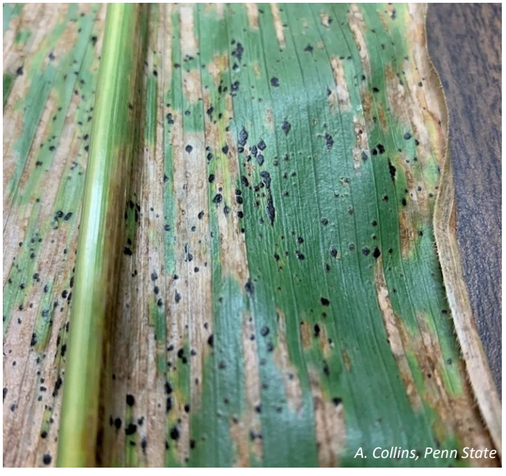
Figure 2. Tar spot symptoms on a corn leaf.

Primary symptoms of tar spot are the presence of glossy black, raised lesions on the leaves (Fig 2). These lesions look like someone splattered paint or tar on the leaves, hence the name. These symptoms have been observed to occur from VT to maturity. Lesions are also visible on dried plant parts.