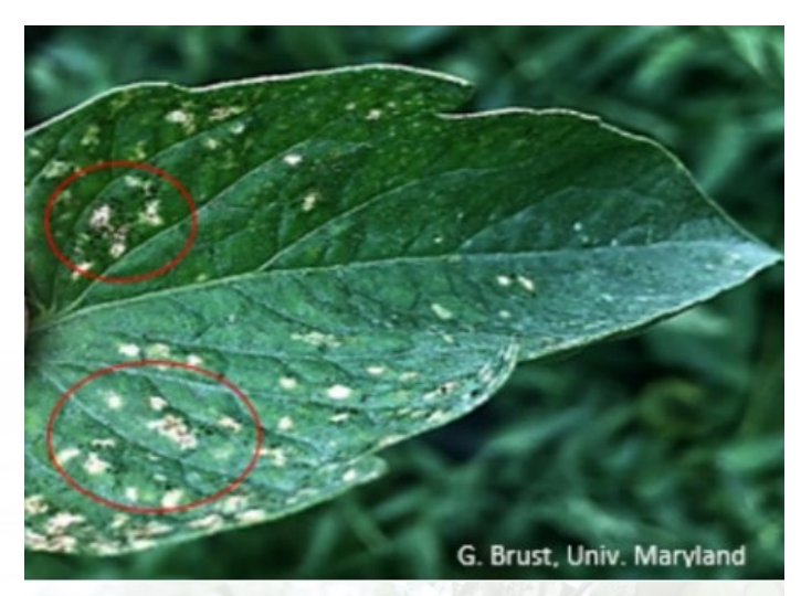
Figure 2. Thrips feeding damage and black specks-thrips feces.

Radiant insecticide would be good to try first if it has not been used much before in the field, if it has a different chemistry such as Torac or Harvanta should offer better control (each has a 1-day PHI and a 4-12 hr REI). Growers also report success with controlling thrips using combination products that use a pyrethroid and a neonicotinoid such as Endigo, Brigadier or Leverage, etc. However, growers need to be sure to use high gallonages (50-90 gal/a) and pressures (150-200 psi) and if possible hollow cone nozzles to get the insecticide into the tomato's dense canopy and to the underside of leaves.