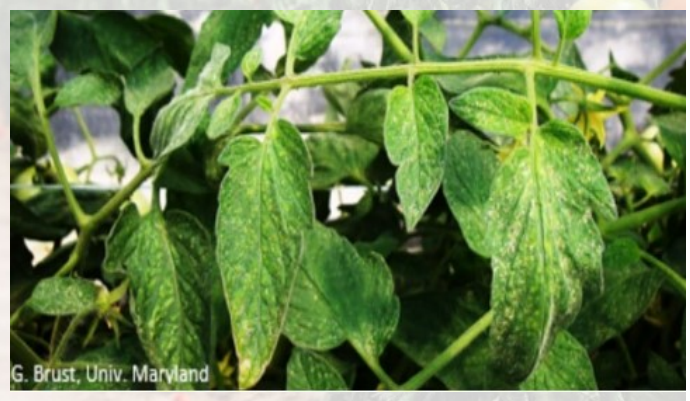
Figure 3. Two spotted spider mite feeding damage to tomato foliage.

Two spotted spider mites do damage that looks similar to thrips, but they do not produce black flecks where they have scarred the leaf tissue (fig. 3). Mites become very difficult to control if you see webbing on the underside or top of an infested leaf. This is because the webbing reduces the mites exposure to any miticides. There are several miticides that work well, provided the material gets to the mites, such as Agri-Mek, Portal, Oberon or Acramite.