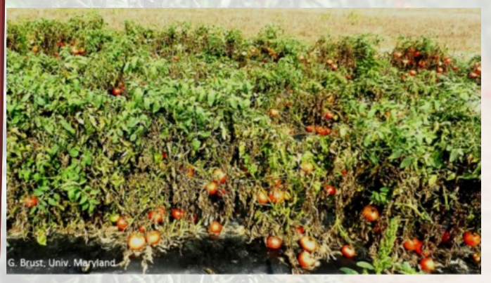
Figure 1. In mid-August plants defoliated because of bacterial spot allow fruit to become sunburned.

Actigard is a plant activator and when used preventively with copper-fungicide treatments has done a very good job of reducing bacterial spot and speck problems in tomato fields. With thrips, the difficulty is getting the chemical controls to the pest on the underside of a leaf on plants with heavy foliage. Thrips feeding damage appears as small white dots or stipples scattered on a leaf often with tiny black specks around these feeding scars which is thrips feces (fig. 2).