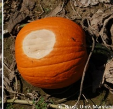
Figure 3. Sunburn (left) and sunscald (right).