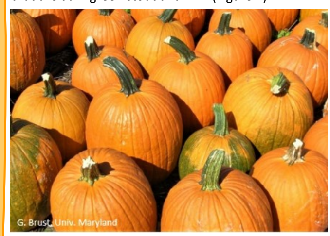
Figure 1. Harvested pumpkins with good handles.

One of the main things a grower can do to ensure a good quality pumpkin is to be sure they maintain their fungicide applications for as long as they continue to harvest fruit. Maintaining good foliage cover for your pumpkins results in pumpkin handles that are dark green stout and firm (Figure 1).