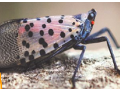
Figure 1. Adult spotted lanternfly life stages.

I hope everyone is having a safe harvest and a great start to the fall! You may or may not have heard that a small population of spotted lanternfly has been confirmed in Harford County, and Maryland Department of Agriculture has begun treatments in an attempt to contain the insect. More information can be seen here. Below is a short article on the spotted lanternfly.