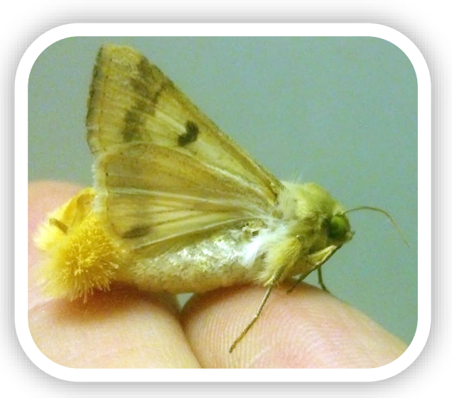
Figure 1. Adult Helicoverpa zea moth.