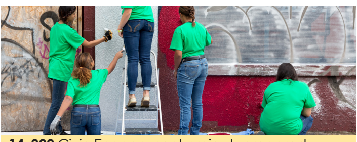
14, 399 Civic Engagement projects prepared