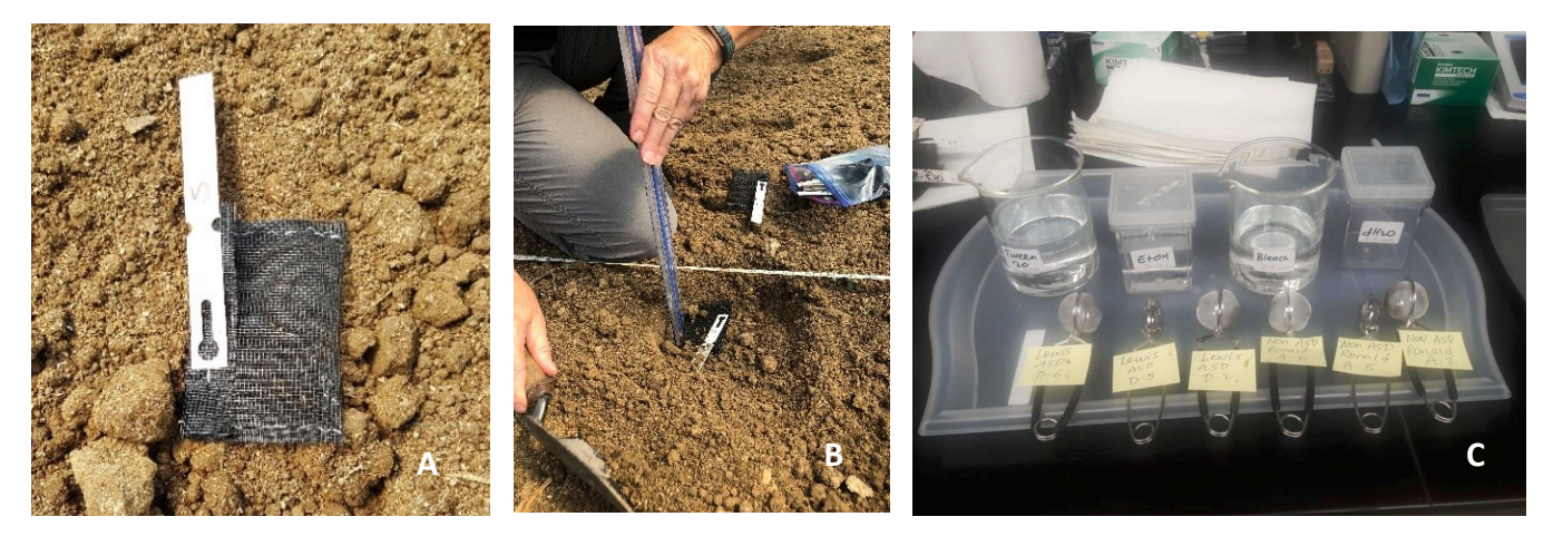
Figure 7) Mesh bags with sclerotia prior to treatment (A), burying the mesh bags (B), and processing the sclerotia following treatment to determine viability (C).

Sclerotia: Significantly more sclerotia survived in the areas of the high tunnels that did not receive the ASD treatment. Only 21% of sclerotia survived the ASD treatment and more than 95% survived where no ASD was applied (P=0.0217). Sclerotia survival did not differ by soil depth (P=0.0587) and varied from 11 to 30% in the ASD treated sections and from 79 to 100% in the untreated sections. This data indicates that overwintering fruiting structures and initial disease inoculum levels in the house can be effectively reduced with ASD treatment. However, Timber Rot and sclerotia fruiting bodies were observed in both treated houses at low levels (6 symptomatic plants per house). Spores from timber rot can enter the house through air currents and infect plants, thus reduction of fruiting bodies inside houses will reduce but not eliminate Timber Rot occurrence.