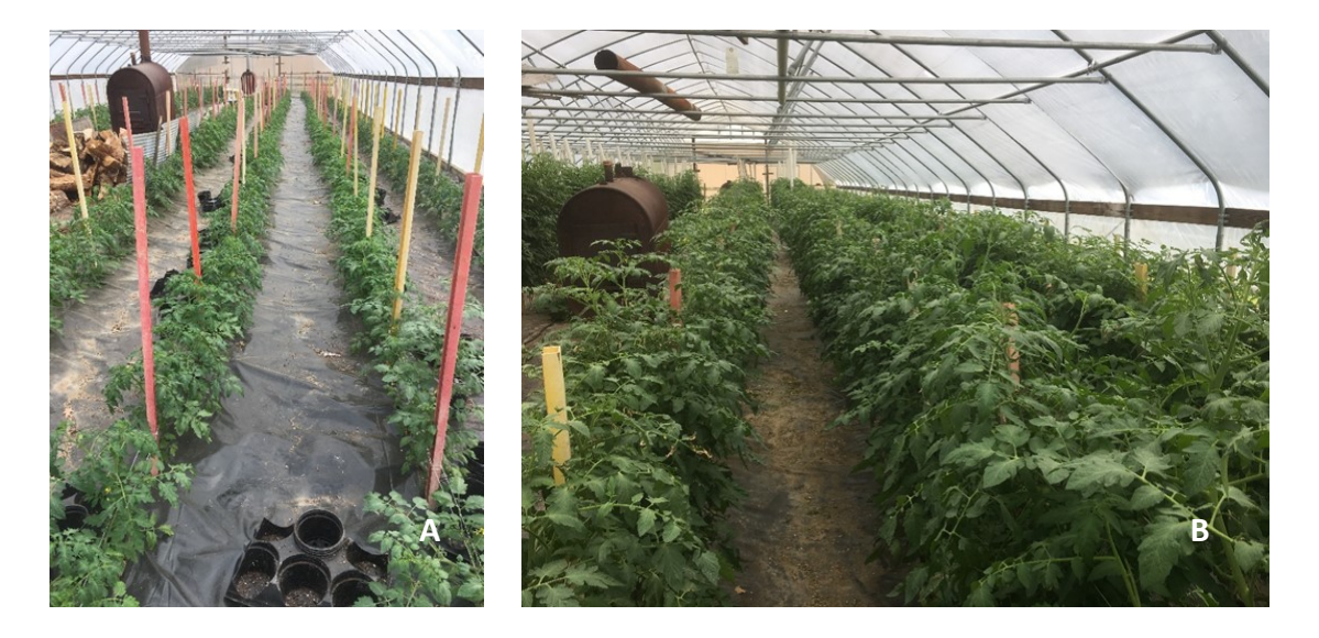
Figure 3) House # 1. A. Plants 1 week after transplanting from 6 inch pots. B. Plants six weeks later. No evidence of wilting or Fusarium Crown Rot is present yet.

Figure 2) House #2. A. Plants 3 weeks after transplanting from 6 inch pots. B. Plants and fruit 2 weeks prior to harvest. Grower reported the highest yield in twenty years from the ASD treated house.