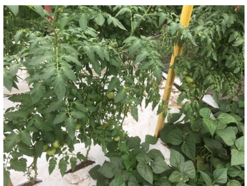
Example of wilting plant infected with Fusarium Crown Wilt from House 1.

In House 2, plants thrived. However we have no way to compare the efficacy of the ASD treatment versus the efficacy of resistant rootstock on grafted