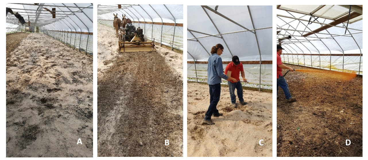
Figure 1) ASD treatement in high tunnel in St. Mary's County A) spreading the wheat middlings, B) incorporating the middlings, C) taking soil samples, D) applying the molasses to the soil.

Prior to treatment, soil fertility and nematode sampling was conducted to determine baseline levels. Nematode and soil fertility samples were taken from similar locations 3 months after treatment. Soil and nematode cores were taken at a depth of 6-8 inches. Soil temperature was recorded in one location manually and in the second location uti-