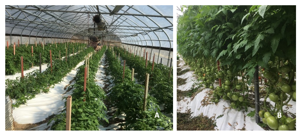
Figure 2) House #2. A. Plants 3 weeks after transplanting from 6 inch pots. B. Plants and fruit 2 weeks prior to harvest. Grower reported the highest yield in twenty years from the ASD treated house.

Growing Summary: Tomatoes plants were seeded in late December of 2018 in seedling flats. Small plants were then transplanted to 72 cell trays for one month and then 6 inch pots for approximately one month. Grafting was conducted when plants were 1/8 inch in diameter at the base. House 1 was planted to non-grafted cultivars Red Deuce, Purple Cherokeee and Big Beef. House 2 was planted to cultivars Red Deuce and Big Beef grafted to Rootstock Cultivar RST -04-105-T obtained from Harris Moran Seed. One non-treated house directly adjacent to House 2 was planted to non-grafted plants of the some cultivars and the other non-treated house was planted to grafted plants of the same cultivars and rootstock. Each house was prepared for planting in February by rototilling to a depth of 6 inches. 4 inch raised beds were formed and the entire growing area covered with 3 mil black plastic and two drip tapes installed for each row. Tomatoes were transplanted from 6 inch pots into the houses on March 9. Houses received supplemental wood heat as needed. Plant nutrients were applied through the drip tape. Plants were staked and trellised using the string and weave method. Tomatoes in all houses were suckered by removing the bottom two suckers below the first flower cluster at planting. In house 2, and adjacent houses, lower leaves and branches were removed prior to harvest.