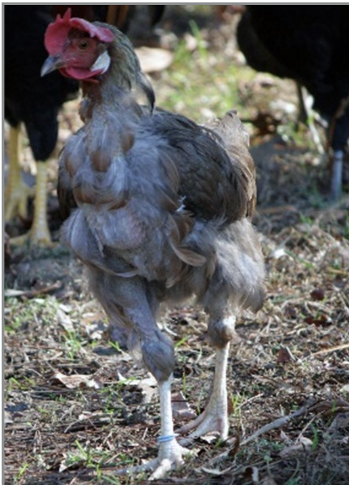
Photo 3. Hens lose their feathers when molting and so will need extra heat or protection

and keep the coldest weather from entering the coop. If you are adding heat to a house, then insulation is a cheap way to get the most heating for your money. Insulation is also beneficial during the summer to keep heat out if the coop.