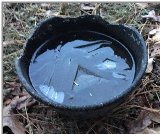
Photo 5. Check/replace water often and make sure that it is not frozen.