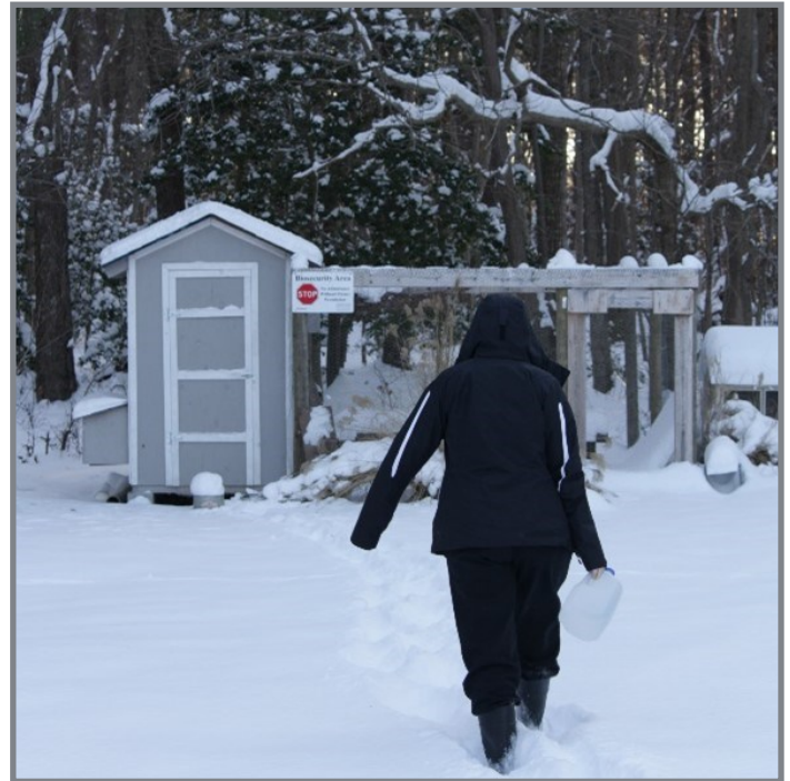
Photo 1. Fix cracks and holes in the coop to keep your flock warm and dry.