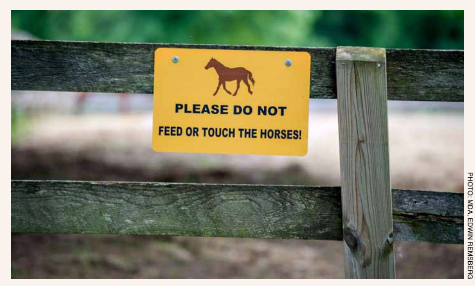
One strategy to consider is hanging warning signs in places visible to visitors.

For more information on status and the duty of care owed to them, see Extension Fact Sheet "Understanding Agricultural Liability: Premise Liabilities"