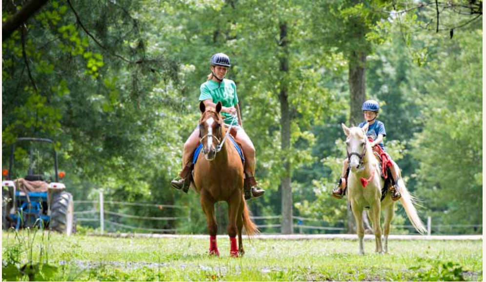
As a livestock owner, you need to understand the laws concerning liability for personal injuries caused by livestock in order to develop a risk management plan for your operation.

nimal agriculture carries certain potential legal risks for liability from injuries caused by livestock. A horse owned by a stable operator, for example, may throw or kick a rider. Cattle may injure a farm visitor. An ornery goat or ram might insist on giving anyone who enters the field a solid head butt, or an unfriendly goose might give chase.