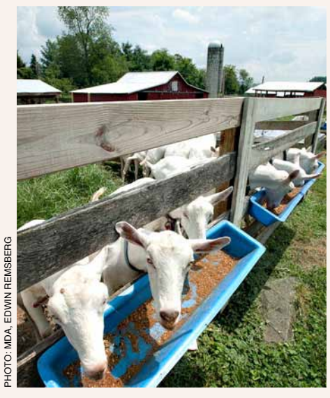
Stable operators or agritourism operators who allow people to come in contact with livestock owe a higher duty of care to protect their customers from unreasonable risks.

Negligence liability ( Pahanish , 1986) stems from the failure to provide the same standard of care as a reasonable person exercising average judgment, skill, and care in the identical situation. An injured party would have to show that you were "unaware of any mischievous propensity on the animal's part, if (you, as the owner of the animal) . . . failed to exercise reasonable care in controlling the animal or preventing the harm caused by (the animal)" (Pahanish, 1986). This is sometimes referred to as a "reasonable and prudent person standard" ( Black's Law Dictionary , 2004). For example, we expect a truck driver of average skill, judgment, and care to fasten down any loads on a flatbed trailer before going down the highway. If the truck driver forgets to tie down the load before leaving, he/she would be negligent.