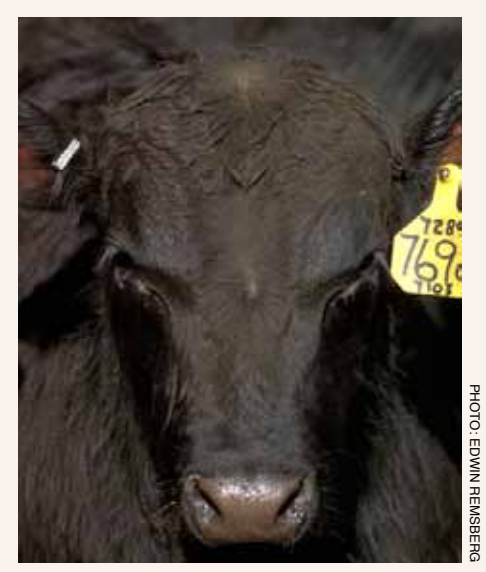
An owner could be found liable if aware of an animal's natural tendency to commit an injurious act.

A trespasser is owed the lowest duty of care—the owner should refrain from wanton and willful injury to the trespasser. An invitee will be owed the highest duty of care—protection from unreasonable risks. Stable operators or agritourism operators who allow people to come in contact with livestock owe a higher duty of care to protect their customers from unreasonable risks.