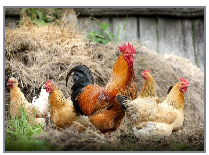
Figure 1. Chickens are a prey species and are watchful of their environment.

Some natural chicken behaviors which are positive indicators of welfare include preening, dust bathing, foraging, and perching, as well as play, aggression, and reproductive behaviors. Additionally, chickens are a flock species and need to be raised in groups promoting social behaviors. Social hierarchy is important and helps maintain social balance. Time spent engaging in natural behaviors will vary between breeds and individual chickens. Therefore, it is important to know what is normal for your specific birds.