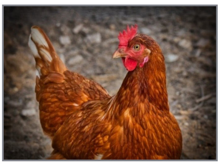
Figure 6. A healthy chicken.

In summary, sickness, injury, and distress are challenging to detect in chickens due to their stoic nature, but it is possible through observing sickness behaviors and changes in normal or natural behaviors. Natural chicken behaviors include walking, eating, foraging, dust bathing, play, and reproductive behaviors. Sickness behaviors, on the other hand, can include lethargy (fatigue), anorexia, self-isolating, and hunching. These behavioral changes are often a symptom of the immune system responding to infection, tissue damage, and stressors due to cytokine action and cytokine signaling. Sickness behaviors can occur in tandem with physiological signs of illness. Sickness behaviors aid in recovery by suppressing pathogen growth or multiplication or by reallocating bodily resources and energy within the body from less essential functions to fighting disease or healing. Despite this, it is important to intervene and manage illness, injury, and distress in chickens to improve individual and flock health and welfare.