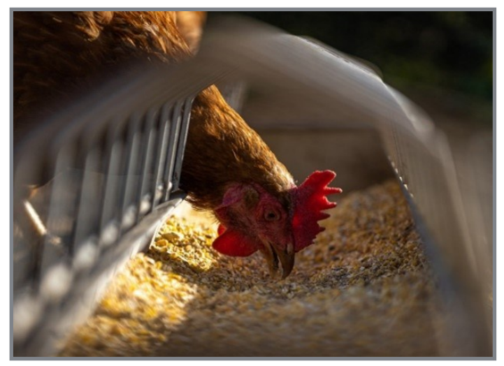
Figure 5. Chicken eating feed from a feed trough.

In summary, sickness, injury, and distress are challenging to detect in chickens due to their stoic nature, but it is possible through observing sickness behaviors and changes in normal or natural behaviors. Natural chicken behaviors include walking, eating, foraging, dust bathing, play, and reproductive behaviors. Sickness behaviors, on the other hand, can include lethargy (fatigue), anorexia, self-isolating, and hunching. These behavioral changes are often a symptom of the immune system responding to infection, tissue damage, and stressors due to cytokine action and cytokine signaling. Sickness behaviors can occur in tandem with physiological signs of illness. Sickness behaviors aid in recovery by suppressing pathogen growth or multiplication or by reallocating bodily resources and energy within the body from less essential functions to fighting disease or healing. Despite this, it is important to intervene and manage illness, injury, and distress in chickens to improve individual and flock health and welfare.