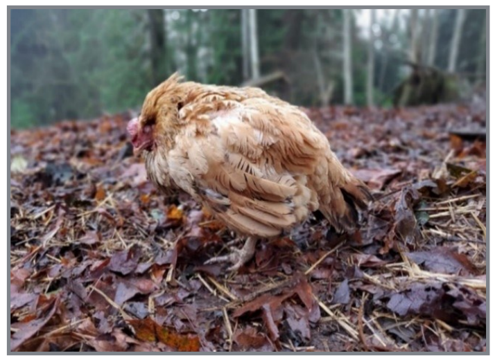
Figure 4. This chicken exhibits hunching behavior, standing with its feathers ruffled and its neck pressed to its chest. The bird's head is down, eyes closed, and wings drooped, indicating that this chicken is ill.

These trade-offs help reallocate resources and energy to healing and fighting infection, particularly through the febrile response (fever) which both suppresses and destroys pathogens during infection (Hart and Hart, 2019). Fever is associated with high metabolic costs, and the febrile response is aided by behaviors and metabolic changes that reduce heat loss, increase heat production, and conserve energy (Hart and Hart, 2019).