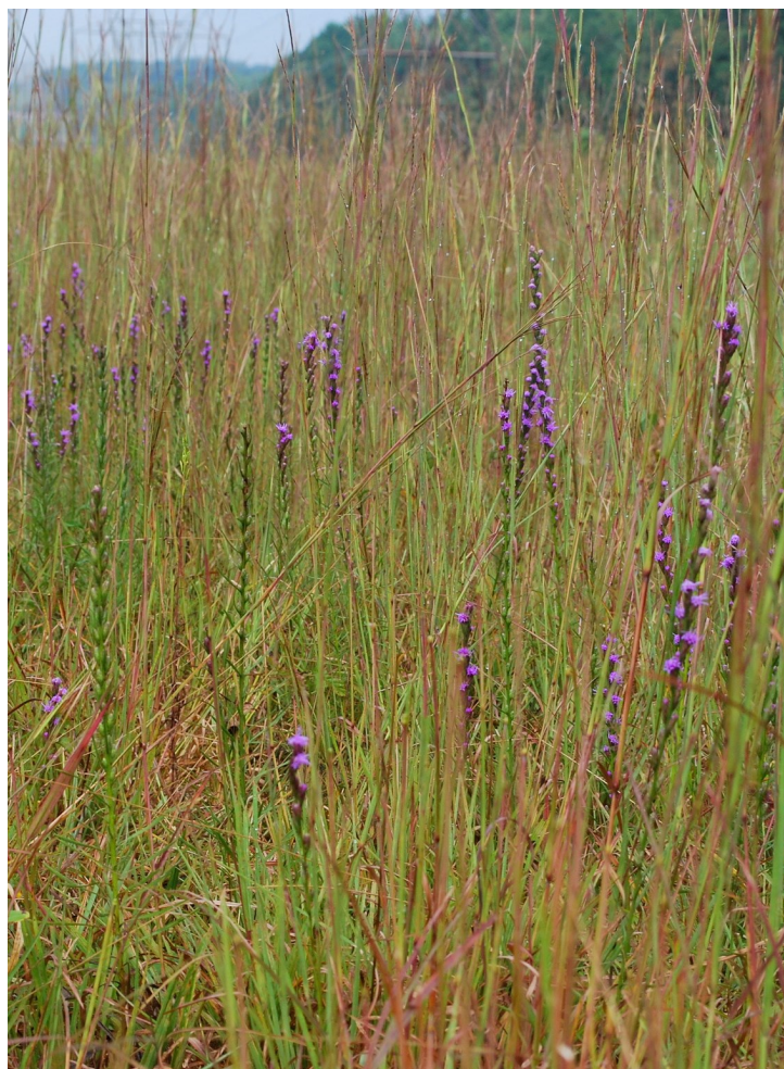
Shaggy blazingstars blooming in a field of little bluestem.

Some plant species are particularly successful in the anthropogenic meadows of Maryland's Coastal Plain. Anthropogenic meadows are areas that lack the tree cover typical of the Eastern Deciduous Forest because of human activity. Examples can be seen along roadsides, under utility lines, or where pastures or crop fields have been abandoned. The meadow species that thrive in these areas are well adapted to human disturbance and require