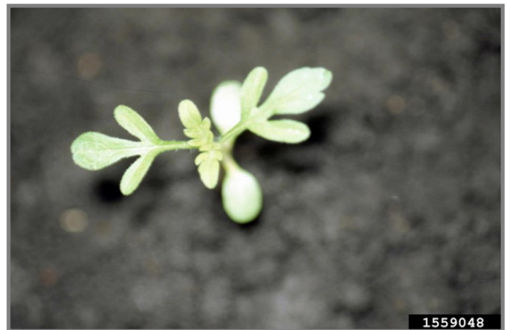
Figure 2. Light and temperature determine germination of common ragweed