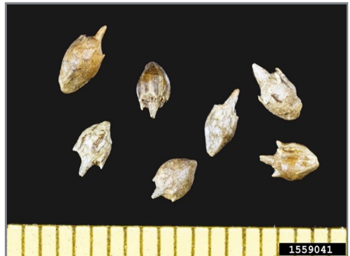
Figure 1. Common ragweed seeds must go through a cold period to initiate germination.

Seeds must go through a cold period to initiate germination which is controlled by light and temperature. Most ragweed plants emerge from seeds in the top layer of soil (Figures 1 and 2). The early emergence pattern of ragweed allows it to grow to heights that can be difficult to control when crops are planted. The majority of common ragweed plants will emerge in early spring. After emergence, plants will grow through spring and begin flowering when day length begins to shorten after the summer solstice.