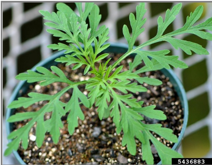
Figure 3. Ragweed has deeply lobed or divided leaves.

Ragweed has deeply lobed or divided leaves (Figure 3). The base of the ragweed leaf is normally wider than the tips. Ragweed has male and female flowers on the same plant, with the male flower located near the top and female seed heads at the base of upper leaves.