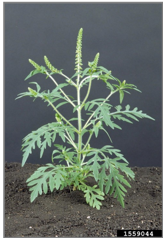
Figure 4. Common ragweed flower heads are one to three inches long.

Three-way resistance to PPO, ALS and glyphosate is expected to spread, leaving very few effective postemergence herbicide choices. In order to delay the onset of resistance and to create a more effective weed control program, researchers strongly encourage growers to integrate several weed control tactics (cultural, biological, mechanical, chemical) into their management plan.