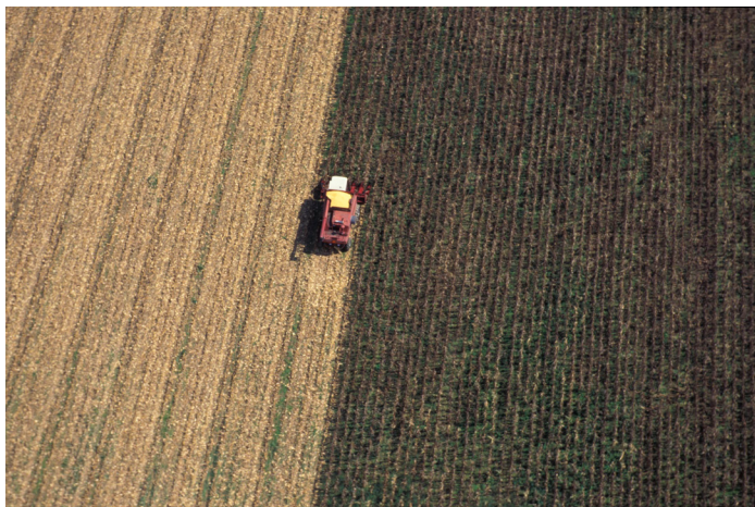
Combining each farmer's data across a geographic region is generally considered "big data."

The concept of big data in agriculture refers to aggregated farm data gathered from numerous farming operations into a single database or repository. For example, corn growers may collect site-specific geospatial and metadata (information which describes, explains, or locates data to make it easier to retrieve, use, or manage) across many acres. Site-specific geospatial data may include as-applied seeding rates, soil nutrient information, and yield monitoring data. Metadata include the number of acres, and when, where, and which inputs were applied and cultivars planted.