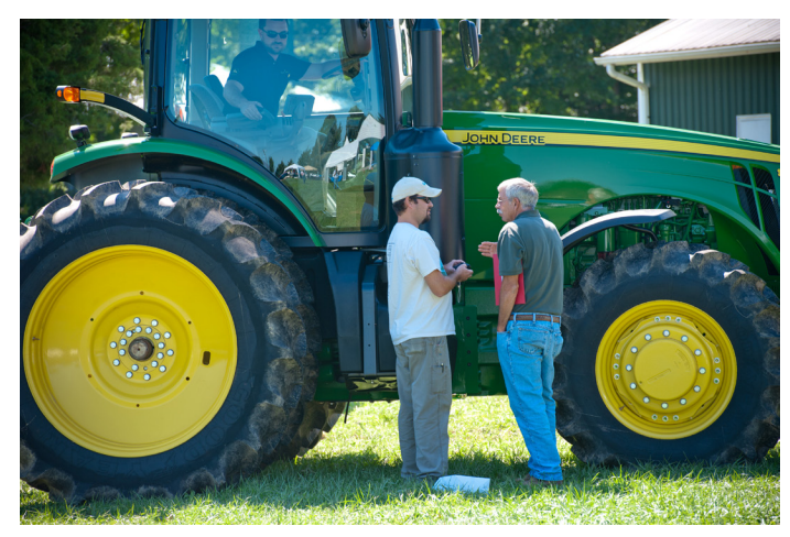
Privately held agricultural data can be excludable while solely in the possession of the party that generated it; however, once the data are shared with other parties or aggregated, excludability is eliminated, at least from the farmer's perspective.

The next logical question is whether data can be considered excludable or non-excludable (Griffin et al., 2016). Excludability depends on several factors such as whether the data was shared with a thirdparty or within a community, and if ownership can be maintained. Excludable goods carry the owner's right to deny access to others. Most privately held goods are excludable.