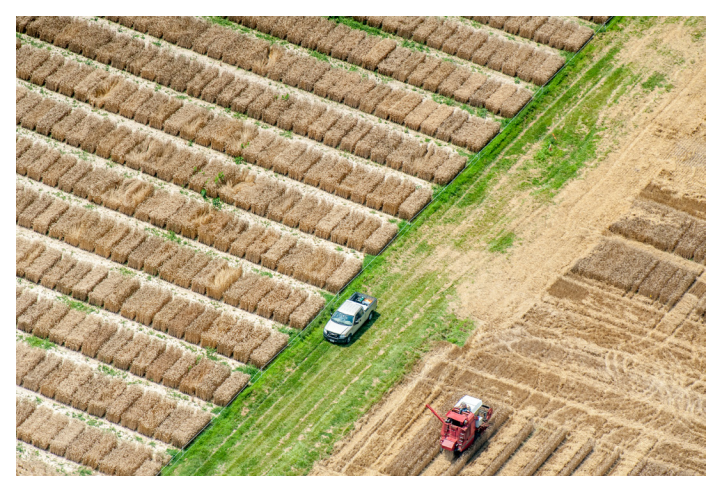
If a group or cooperative of farmer data are misappropriated, proving actual collective damages may be easier due to the value added for regional data, for example, versus individual farm data.