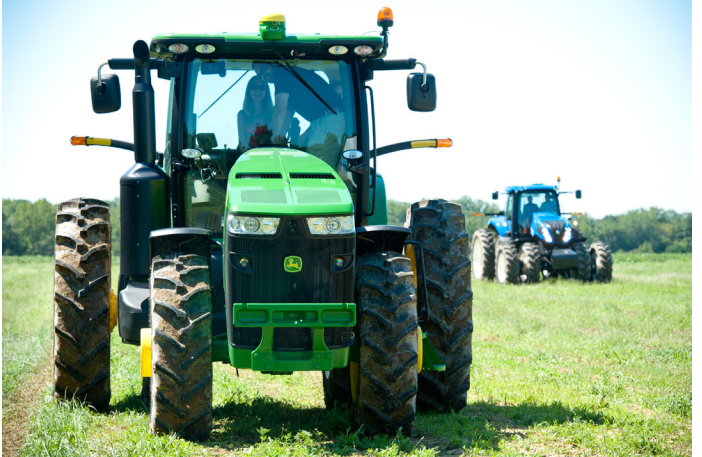
olumbia, Puerto Rico,

As of 2016, New York, North Carolina, and Massachusetts continue to apply their own definitions and standards (Legislative Fact Sheet).