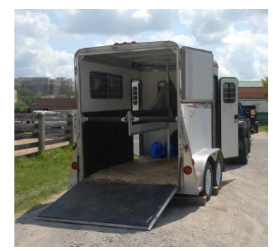
A trailer with a rear-loading ramp.

The design of the back door on the trailer will determine whether the horse loads the trailer by walking up a ramp or by simply stepping up into the trailer. If the trailer door is hinged at the floor, the door folds down into a ramp. If the trailer door is hinged on the side, it swings open and is known