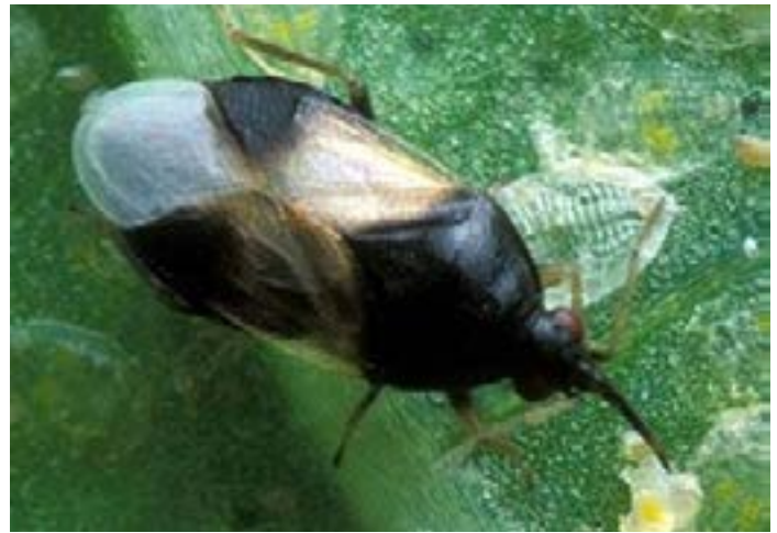
Figure 7. Adult stage of the minute pirate bug, Orius insidiosus .

When ordering biological control agents, most suppliers require overnight shipping to reduce transport time and ensure live delivery. Keep in