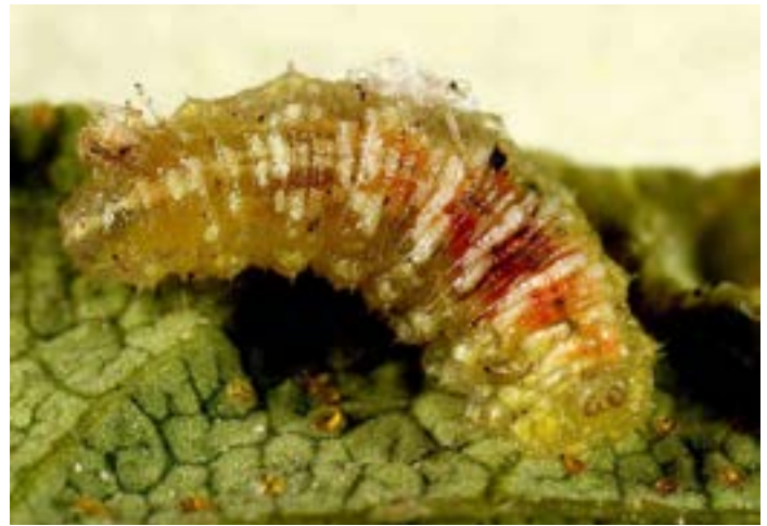
Figure 6. Larval stage of the predatory gall midge, F. acarisuga .