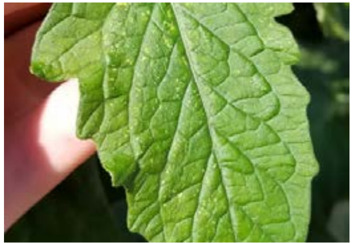
Figure 2. Early spider mite damage on tomato leaf.

Augmentative biological control is a pest management tactic whereby natural enemies are intentionally released into an environment to reduce pest populations and prevent outbreaks. Several biocontrol organisms can be used to control thrips and mites in high tunnels (Table 1). The ability of each biocontrol organism to successfully manage a pest will depend, in part, on the size of the pest population when the biocontrol agent is released. Table 1 indicates which biocontrol agents are more suitable for preventative use and which can effectively control an existing outbreak. When choosing a biocontrol agent for augmentative releases, it is important to understand the required environmental conditions for each species, as their efficacy will vary based on temperature and humidity levels. The optimal temperature and humidity ranges