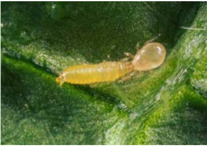
Figure 3. An A. swirskii predatory mite attacking a larval stage thrips.

immature stages and adult A. swirskii mites are predatory, they are only able to attack egg and early larval stage thrips and are therefore most effective when used as a preventative tactic. Releases should therefore occur when thrips populations are low. A. swirskii is not an effective biological control agent for managing pest mite species.