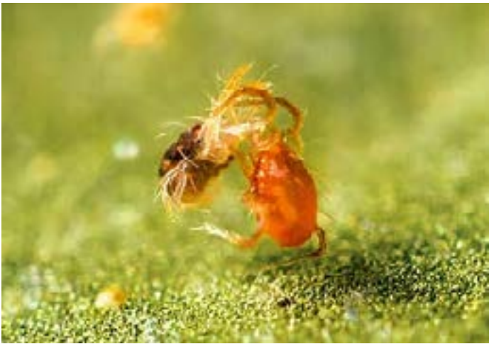
Figure 5. Predatory mite P. persimilis (right) feeding on spider mite (left).