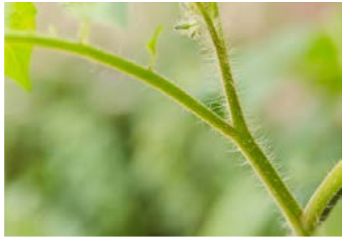
Figure 4. Trichomes, or small hairs, on tomato plant stem.

N. cucumeris is a predatory mite recommended for thrips control as well as control of spider, cyclamen, and broad mites in high tunnel production. Both nymph and adult stages are predatory, but all stages will only attack first larval stage thrips. Establishment of N. cucumeris can take up to four weeks and should therefore be made preventatively, before thrips/mite infestations have been detected. Because N. cucumeris will also feed on eggs and immature stages of other predatory mites, they are better used alone or in combination with non-mite biocontrol organisms.