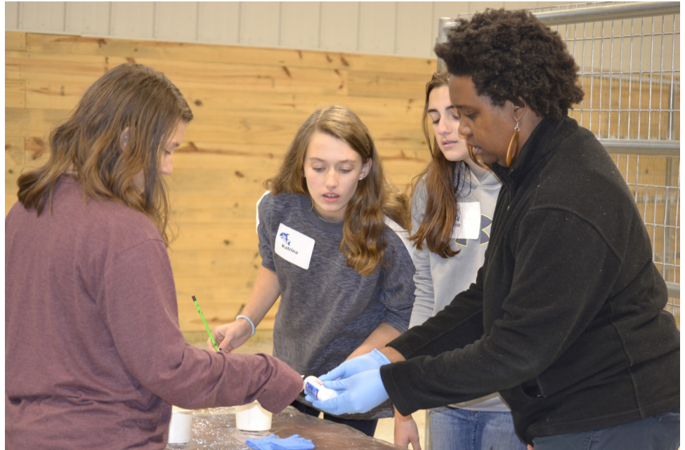
Figure 1. Educators can attend events sponsored by other organizations. This gives an opportunity to hands on 4-H lessons and increase visibility in the community.

In keeping with the tradition of 4-H, it is important that educators find innovative ways to create opportunities to increase their networks. Outreach, networking and partnership are ways to share the mission of 4-H and provide positive youth development to underserved populations (Figure 2). By making time to stretch outside of the traditional delivery methods, new populations of youth can be reached. New leaders from diverse backgrounds