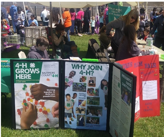
Figure 3. Club members or educators set up educational displays at events to share information about 4-H and reach new audiences. Presenters are careful to collect contact information for follow up after the event.

making network connections, it is important to consider the following: