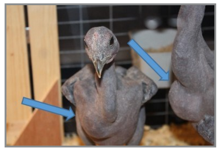
Figure 2. Side and front view of a featherless bird with full crop pointed out by the arrows.

it more easily if you compare the affected bird with another one. Be gentle while palpating enlarged crops with excessive fluid as aggressive massaging may cause aspiration pneumonia.