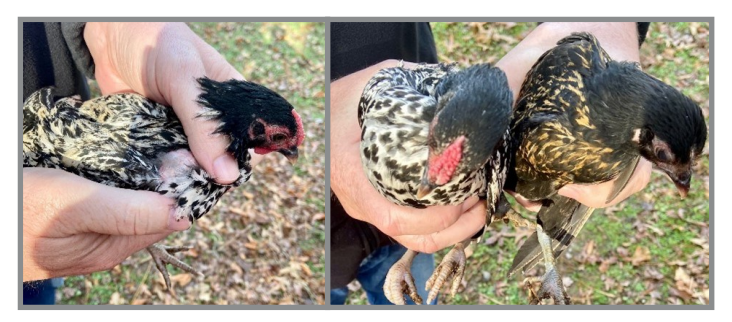
Figure 3 Shows impacted crop (young male) compared to normal (young female).

Be careful not to over diagnose this condition. If you suspect a bird has an impacted crop, isolate it with water and no feed to see if the condition corrects itself. After fasting, if the crop is empty, the bird may have just eaten a big meal before you checked it. If the crop is still full, it may have eaten something indigestible. Continue to provide lots of water and gently massage the crop to help move the material through the digestive track. If the impaction lasts for days and becomes harder, surgical intervention might be necessary to alleviate the problem. Contact your veterinarian before it's too late.