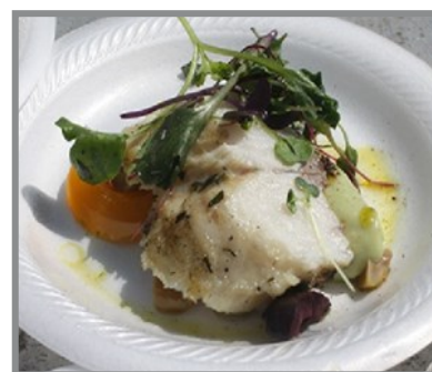
Delicious Chesapeake Bay Blue Catfish

An estimated 7,265 pounds of blue catfish were served on campus during the fall 2019 semester.