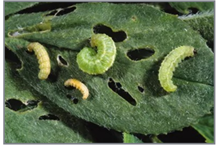
Figure 5. Alfalfa weevil larvae progress through four instars before pupation. Late instar larvae cause economic damage.

The life cycle of alfalfa weevil in Maryland and states with similar climates usually consists of one full generation per year. Adults disperse in the fall and can lay eggs but generally a second larval generation does not occur in one year.<sup>2</sup> In the spring, adults emerge from overwintering sites and restart laying eggs. Adults oviposit 5-20 orange eggs in alfalfa stems (Figure 4). Due to fall and spring egg laying, two pulses of larvae may be seen in the spring, which can impact management decisions.<sup>3</sup>