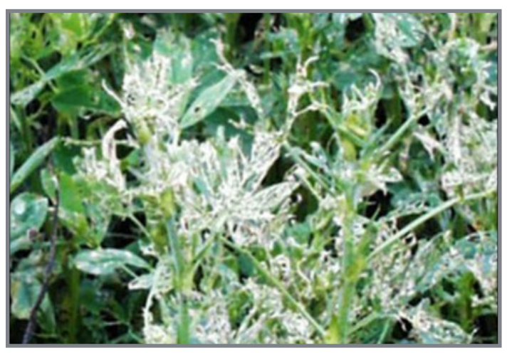
Figure 6. Typical leaf terminal skeletonization caused by larval and adult feeding.

Signs of Alfalfa Injury First Occur as Pinholes in Early Growth on Terminal Leaves of Alfalfa and Other Legumes, Such as White Clover