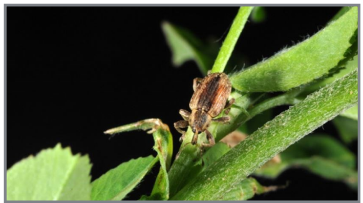
Figure 1. An adult alfalfa weevil on the leaf of an alfalfa plant.

The life cycle of alfalfa weevil in Maryland and states with similar climates usually consists of one full generation per year. Adults disperse in the fall and can lay eggs but generally a second larval generation does not occur in one year.<sup>2</sup> In the spring, adults emerge from overwintering sites and restart laying eggs. Adults oviposit 5-20 orange eggs in alfalfa stems (Figure 4). Due to fall and spring egg laying, two pulses of larvae may be seen in the spring, which can impact management decisions.<sup>3</sup>