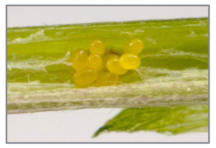
Figure 4. Oblong, orange alfalfa weevil eggs are found in alfalfa stems.

First instar larvae emerge from the eggs after one to two weeks. In Maryland, alfalfa weevil larvae take about three weeks to progress through four instars (Figure 5) then they form silken cocoons and pupate at the base of the alfalfa plant or on alfalfa stems. Pupation can last one to two weeks before second-generation adults emerge in mid-June.<sup>4</sup>