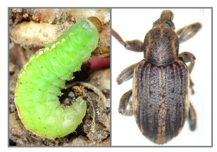
Figure 3. Late instar clover leaf weevil larva (left) and clover leaf weevil adult (right).