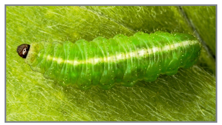
Figure 2. Late instar alfalfa weevil larva with characteristic black head and dorsal white stripe

First instar larvae emerge from the eggs after one to two weeks. In Maryland, alfalfa weevil larvae take about three weeks to progress through four instars (Figure 5) then they form silken cocoons and pupate at the base of the alfalfa plant or on alfalfa stems. Pupation can last one to two weeks before secondgeneration adults emerge in mid-June.<sup>4</sup>