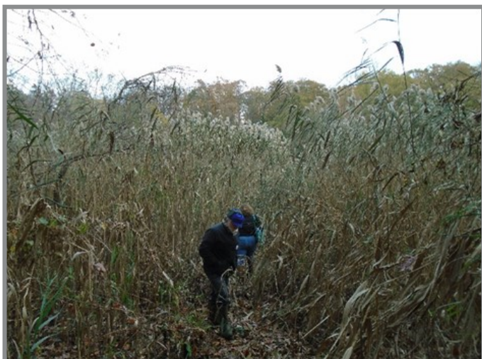
Figure 1. Project research scientists evaluating a stand of Phragmites on the Severn River to determine if conditions meet the project's criteria for restoration and monitoring.

Phragmites is tall with distinctive, fluffy inflorescences, or seedheads (Figure 1). Its growth occurs in the spring and summer with clonal spread of plants through underground stems. New plants also arise from seeds produced the previous year. Most new stands start from seeds.