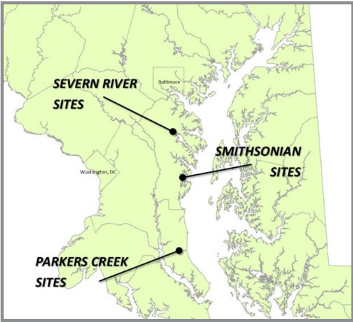
Figure 2. Location of the three Maryland wetland research sites. Within each wetland site, multiple study areas are assessed across a range of tidal flooding and salinity levels.

ways to offset some negative impacts of Phragmites eradication, researchers from the Smithsonian Environmental Research Center (SERC), the University of Maryland, and Utah State University received funding from Maryland Sea Grant College and the Smithsonian Institution to investigate the potential of native plantings in restoring native plant communities following Phragmites ’ removal. As part of an ongoing two-year project, the researchers planted native wetland species at tidal marshes in Maryland’s Chesapeake Bay region where Phragmites had been removed (Figures 2 and 3, Table 1).