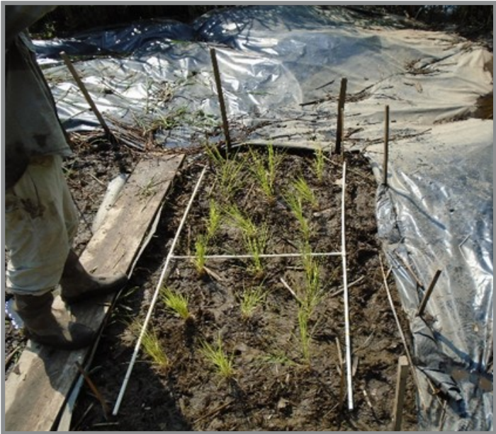
Figure 3. Typical research plot where plant growth and other factors are being monitored. The black plastic is used to control the re-emergence of Phragmites .

related to the frequency of tidal flooding – drier sites had higher growth and survival. The preliminary results suggest that frequently flooded marshes may be particularly vulnerable following Phragmites ’ removal. The importance of tidal flooding is being examined in a separate marsh-organ experiments (Figure 4), where the