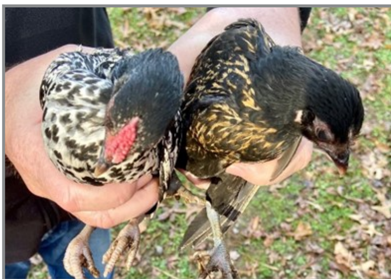
Figure 3 Shows impacted crop (young male) compared to normal (young female)

or other indigestible material. Additionally, diseases that affect the nervous system, such as Marek's disease, can lead to impacted crops.