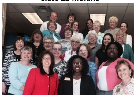
Class 12 Indiana