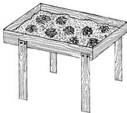
Figure 1. Faceup drying.

Faceup drying. To dry flowers faceup, use a shallow box with 3- to 4-inch sides, supported 8 to 10 inches from the ground by wooden legs or by another box (Figure 1). Spread several layers of newspapers on the bottom of the box and punch holes through the bottom of the box and the newspapers. The holes should be large enough for stems or wires to go through and far enough apart so flower heads do not touch.