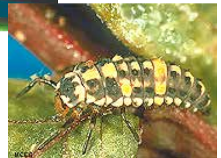
Ladybird Beetle Larva