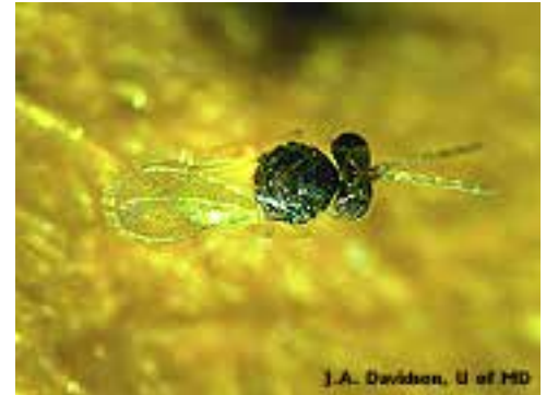
Encarsia (sp.) wasp

Parasitic wasps: a large group of small to large wasps that parasitize a variety of caterpillars, beetle larvae, flies, aphids and other insects. They are slender and black or yellowish to brown. They have a pinched waist and clear wings. Some females may have very long ovipositors or “stingers”, but they can not sting people. The female inserts her eggs into host insects. When the larvae complete their development, they spin cocoons on or near a dead or dying host, and then pupate. Parasitized hornworms are often seen with many white, silken cocoons attached to their bodies. Egg and larval parasites are available commercially.