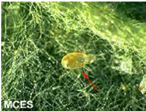
Adult Phytoseiid Mite

Predatory mites: widely used as biological control organisms. They are the same size or larger than spider mites and move rapidly. The color may be white, tan, orange or reddish. Predatory mites are commercially available and the supplier can suggest the species and quantity to buy.