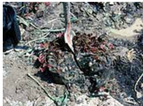
Dividing & planting

When working with aquatic plants keep the roots moist and protected from the sun. The foliage of water lily is very sensitive to drying out and should be kept moist during all stages of planting. When planting water lilies and other aquatic plants, be careful not to bury the growing point, or rhizome, too deep in the potting soil. This usually leads to