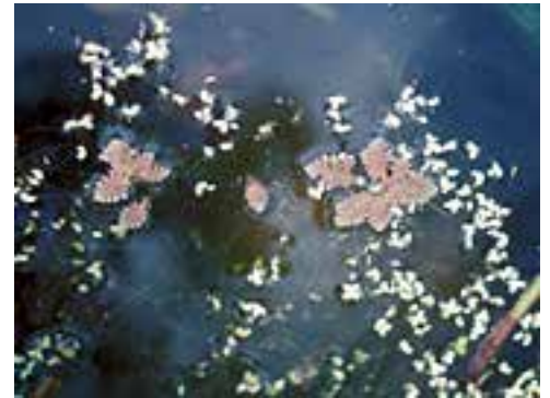
Azolla and Duckweed