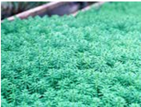
Myriophyllum - Parrot's Feather