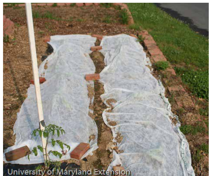
Pepper and eggplant getting a fast, protected start under FRC

crops as soon as they are transplanted. Remove the cover when plants begin to flower. You could also simply drape the row cover directly over the plants without any frame. Just leave enough slack for the plants to grow up and remove the cover when it’s time to cage or stake your tomato plants. FRC will speed the growth of these plants and protect from damaging flea beetles, cutworms, Colorado potato beetle, and aphids in the spring.