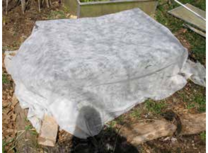
Lettuce over-wintering under FRC

The flowers and fruits of bean, tomato, and pepper will abort to some degree when daytime temperatures top 90° F. because temperatures under the cover may be 5°-15° higher. Reducing the air movement needed for pollination may also contribute to reduced fruit set. Disease problems may be worse under FRC left in place through the summer months because of increased humidity and reduced air movement. Remove FRC from these crops when they start to flower.