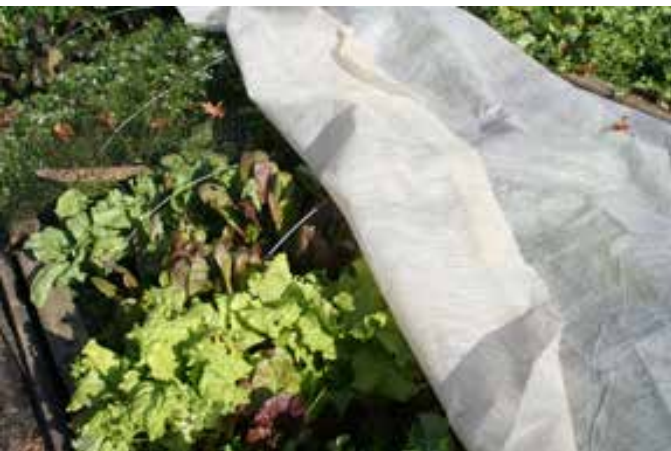
Fall greens under FRC

Below is a brief guide for using FRC with specific vegetable crops: