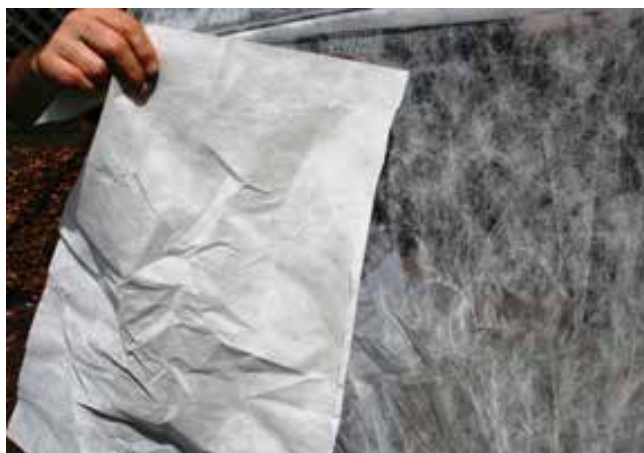
Closeup of light and heavy weight floating row covers