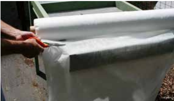
Large quantities come on a bolt; cut to size with scissors. Small quantities can sometimes be found in retail stores

Conducting an internet search on “floating row cover” will yield many suppliers. FRC can be most easily cut to size using sharp scissors.