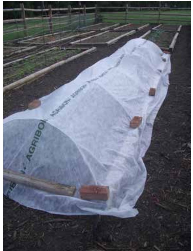
Nice low tunnel at a Kent Co. school garden protecting spring crops

These upright plants require some type of frame to raise the cover above the plants (see “Two Frames for Supporting FRC” below). Cover these warm-season