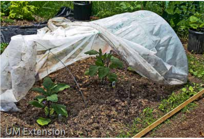
Protecting eggplant under a frame