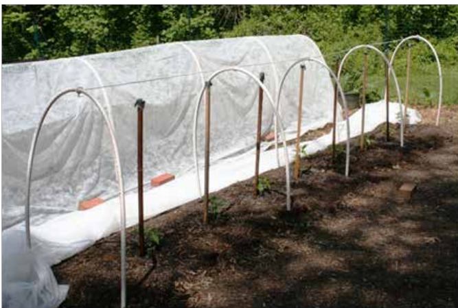
For a planting bed: 2' wide x 18' long (42" to top of hoops)