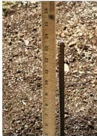
Drive the rebar 10-12" into the ground, leaving about 14" above ground

The five sets of rebar are there to support five pvc bows. To give the first and last plants a little extra room add one foot to each end of the low tunnel. This gives a 5-ft. space between the 1st and 2nd bows and the 4th