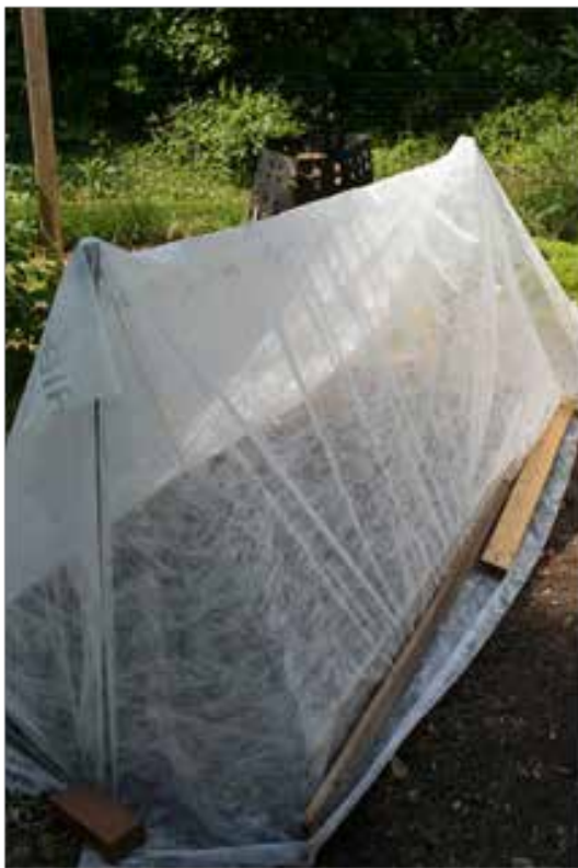
For a raised bed: 3' wide x 8' long x 4' high

Drive a 6 ft. metal fence post 2' into the ground at either end of the raised bed and connect the posts with a piece of wire. (We used 17 gauge electric fence wire.) Fasten pieces of wire from the top of each post to the corners of the raised bed to create the "A" and provide