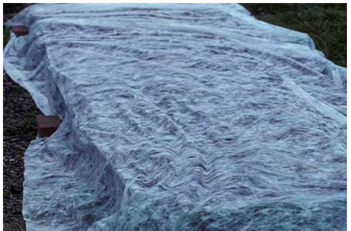
Spring greens under FRC

Cover these crops as soon as they are planted or transplanted. FRC gets these crops off to a strong start and protects against frost and various insects. FRC can become difficult to use when these crops get tall. Also, many of these crops grow through the hottest part of the growing season and it may be necessary to remove the covers by mid-June to prevent heat build-up and disease problems.