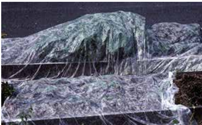
Mature lettuce pushing up FRC

Leave FRC on these cool-season crops March-May and mid-September-Thanksgiving. FRC can be used over salad greens from planting through harvest. Check temperatures under the covers if these crops are growing from mid-June-August. FRC significantly speeds the growth and increases the productivity of these crops. It also excludes bunnies, cabbageworm, aphids, harlequin bug, and Mexican bean beetle.