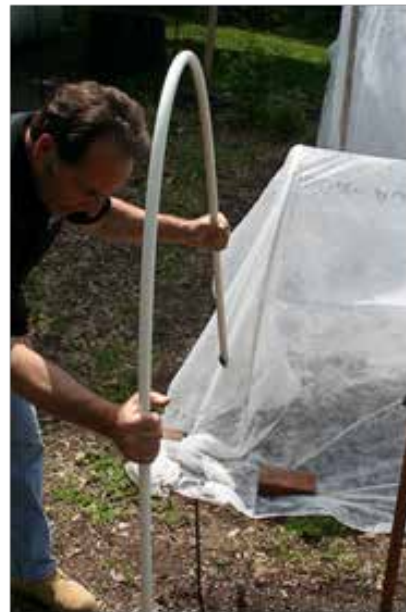
Sliding the pvc down over the rebar