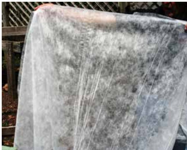
Closeup of floating row cover

FRC can be purchased through mail order seed and garden supply companies and at some local garden centers. Some brand names are Remay and Agribon.