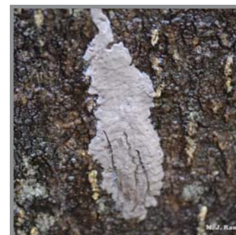
Figure 3. Grey-brown spotted lanternfly egg mass.

compound leaves which release a strong unpleasant smell when crushed.