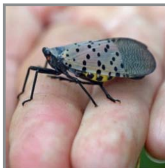
Figure 2. The adult spotted lanternfly at rest covers its brightly colored hind wings with its grey and black front wings.

In addition, it produces a large amount of waste, called honeydew, which is very sugary. The honeydew sticks to leaves and fruits where it attracts other pests and promotes the growth of sooty mold, which contaminates and reduces the value of the fruit. The favorite host for the spotted lanternfly is tree of heaven ( Ailanthus altissima ), an invasive weedy tree that grows in disturbed areas on field edges and roadsides. Early research suggests that spotted lanternfly must feed on tree of heaven to reproduce and to gather the chemicals which make it poisonous. Tree of heaven has large