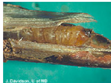
Dogwood twig borer

To control dogwood twig borer, infested twigs should be clipped off several inches below the girdled or infested portion and destroyed. This should be done after wilting occurs and before adult emergence in the spring. This insect usually does not cause serious problems.