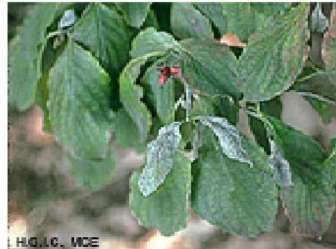
Powdery Mildew on Dogwood

In recent years the Microsphaera powdery mildew has become a more severe and wide spread problem. It appears as a powdery white coating on the leaves from early summer through fall. In some years the powdery appearance is less evident. Under severe conditions, the new leaves can become twisted and distorted. Older infected leaves often develop purple blotches that progress to dead areas. Infections cause the loss of water and photosynthetic leaf area which weakens trees and reduces growth.