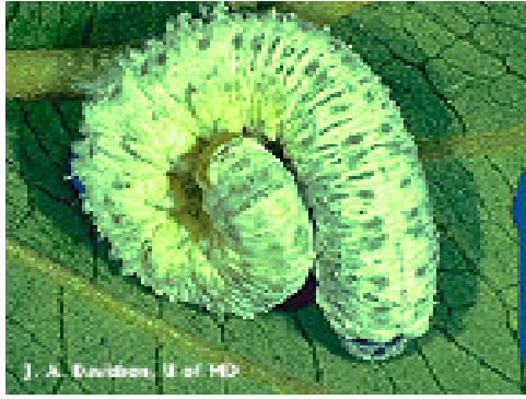
Dogwood sawfly larva

The dogwood sawfly is an occasional pest of dogwood. The larvae feed on the foliage of several species of dogwood. The larvae resemble caterpillars and are most often seen covered with a white powdery material.