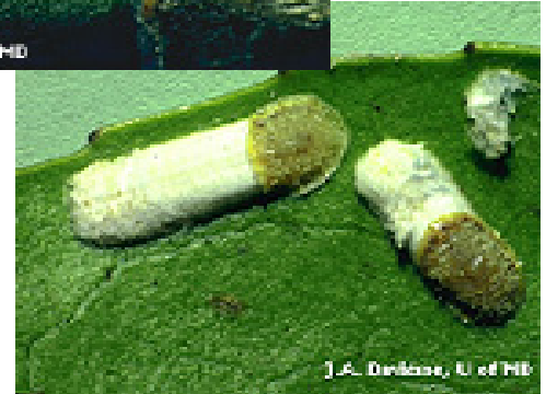
Cottony Maple scale