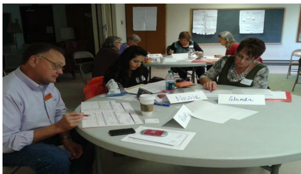
Oregon Certified Educator Training