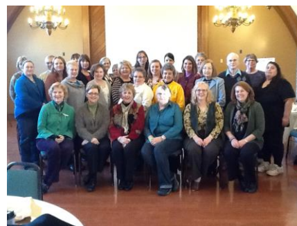
Class 5, November, 2013

A two-day training was held in Minnesota with attendees from MN, ND, SD, WI & NJ. There are now 89 educators in 25 states certified to teach Smart Choice. This tipping point milestone was reached within 3 months. Additional trainings will be held in 2014.