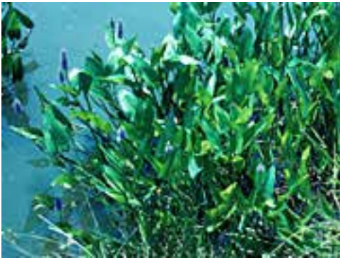
Pontederia - Pickerel Weed