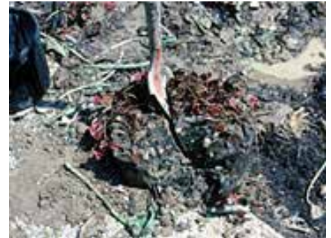
Dividing & planting

When working with aquatic plants keep the roots moist and protected from the sun. The foliage of water lily is very sensitive to drying out and should be kept moist during all stages of planting. When planting water lilies and other aquatic plants, be careful not to bury the growing point, or rhizome, too deep in the potting soil. This usually leads to