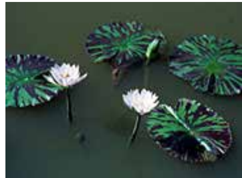
Tropical Water Lilly

Tropical cultivars begin blooming when the weather becomes hot, about mid-June, and continue to bloom steadily until they are killed by the frost in late fall. Do not place them into your pond if the water temperature is at or below 70° F. If too cold, the plant will become dormant for 6–8 weeks, which greatly reduces the growing and flowering period of the plant. The colors of tropical lilies include deep red, yellow, pink, white, and blue. Their blossom size is much larger than the hardy types, ranging in size from 2" inches to 8" inches or more across. As an interesting comparison, the tropical flowers generally bloom 6–12" above the surface of the water while the hardy water lily flowers float