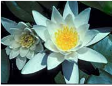
Hardy Water Lilly