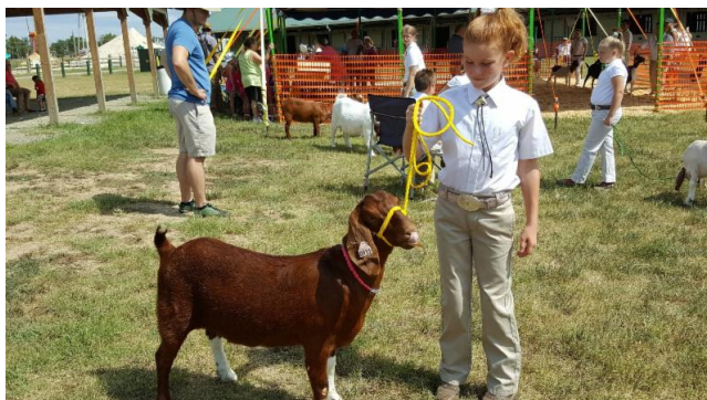
4-H Livestock Showcase

Our county 4-H staff and members are busy preparing for a fun filled fair. Along with the rides, games, bands, and food trucks, 4-H youth will display their animal showmanship, craft projects, and talents. Mark your calendar, the dates are Sept. 5th - 8th, 2019 at The Show Place Arena-Equestrian Center (14900 Pennsylvania Ave in Upper Marlboro).