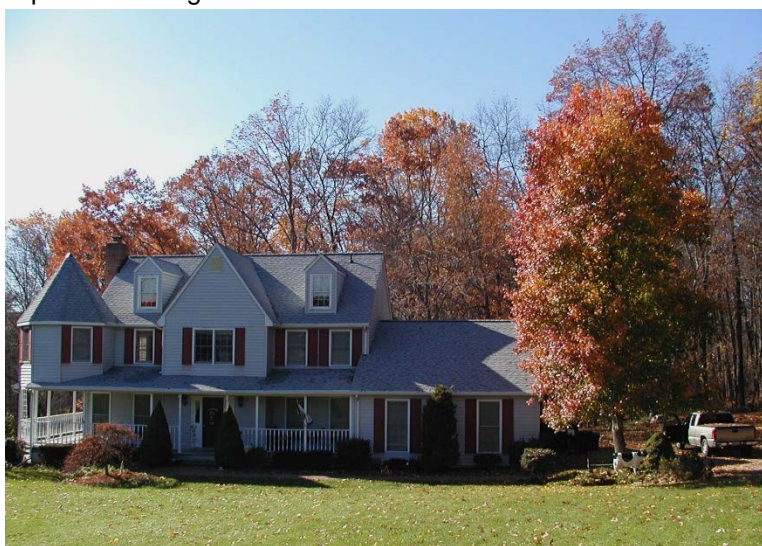
Owners of small-acreage lots with woodlands can benefit from professional assistance in managing their property.

guidance of a licensed forester. Foresters on this list are Licensed Professional Foresters with the State of Maryland's Board of Foresters within the Department of Labor, Licensing and Regulation