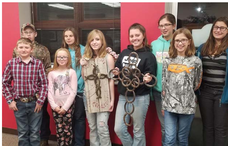
Garrett Hoof Prints Donate to Festival of Trees

All 4-H parents are encouraged to complete the 4-H UME volunteer training class. By attending the class and completing the paperwork, volunteers gain liability coverage under the State of Maryland tort claims act. Adults are required to be documented 4-H volunteers before they work directly with youth at 4-H events. The trainings are scheduled for Tuesday, February 27th at the Extension Office meeting room from 1:00 pm - 3:00 pm & Wednesday, February 28th from 6:30pm - 8:30pm at Garrett College in room 103 in the Garrett Information Enterprise Center. Please call the 4-H office to register for the training at 301-334-6960. If these dates are not convenient, contact Ann at anns@umd.edu to arrange another date and time.