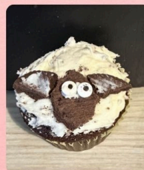
Intermediate Bobby Shrout