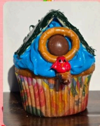
Clover Spencer Leasure