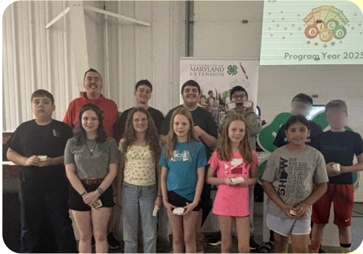
Diamond Clover Awards