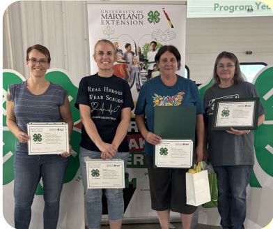
Volunteer Service Awards