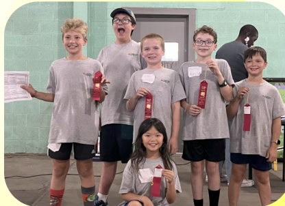
Congratulations to the Frostburg Robotics for Environmental Awareness (3rd) and Frostburg Bug Bots (2nd) on their participation at the Maryland 4-H