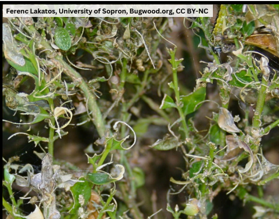
Chewed leaves on boxwood