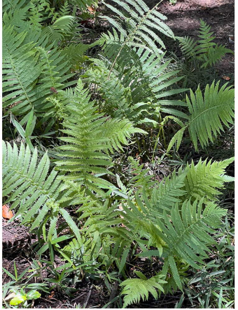
Wood ferns grow well in a shady wooded area.

Thelypteris kunthii is also known as the wood fern and the river fern. This bright green deciduous fern has long arching fronds that have pinnate pinnatifiedor blades. Pinnate means compound, each leave is made up of leaflets, and pinatified means that the leaflets are divided but are solidly attached. These ferns are cold tolerant in USDA zones 7-10, thriving in humus rich moist soils in sun with afternoon shade, also tolerant of poor drainage. Like many ferns, the wood fern spreads forming colonies with creeping rhizomes. Spores are produced in the late summer into the early autumn on the underside of the foliage. The large upright arching fronds grow 2-3 feet tall and 8-12 inches wide, adding light green color to the shady garden floor and a bronze green in autumn. Ferns can be planted in containers, along a shady border and allowed to spread in a shady woodland garden. There are no serious insect or disease pests and deer almost always leave ferns alone.