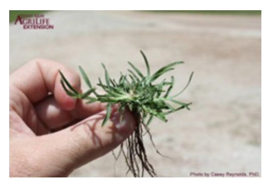
Goosegrass seedling and root system.

Goosegrass is a prolific seed producer. In warmer regions 40,000 to 50,000 seeds per plant is common. Light enhances the germination of goosegrass seeds. Drought and low temperature delay flowering and growth of plants.