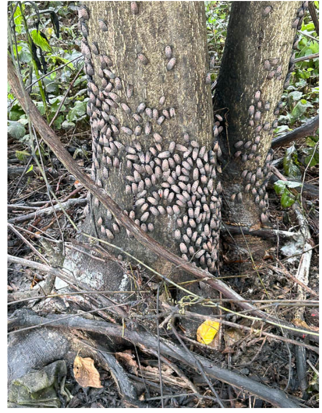
Heavy infestation of spotted lanternfly adults at base of an Ailanthus tree; Note the pooling of honeydew at the base and sooty mold on branches and nearby plants.