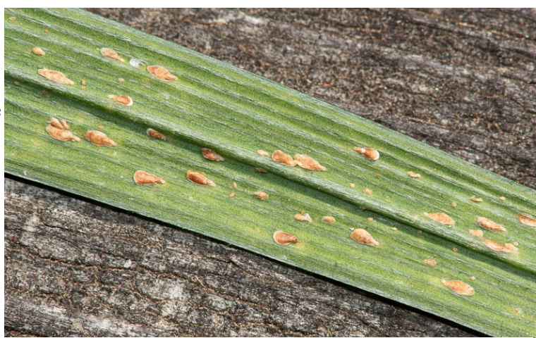
Liriope is one of the plant hosts for fern scale.

Most of the systemic insecticides such as Altus, Mainspring, and Dinotefuran all work well for controlling this scale on herbaceous plant material.