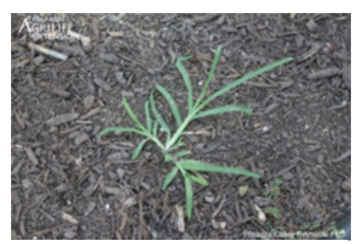
Goosegrass growth habit.

The origin of goosegrass is not clear. Some of the earliest records of goosegrass came from China, India, Japan, Malaysia, and Tahiti.