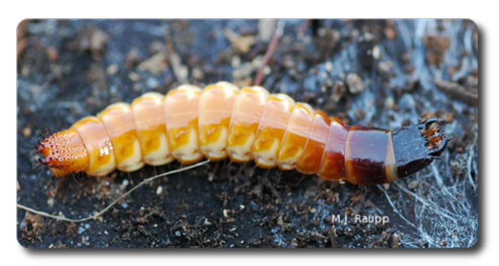
The larva of the eyed elater uses its powerful mouthparts to kill its prey.