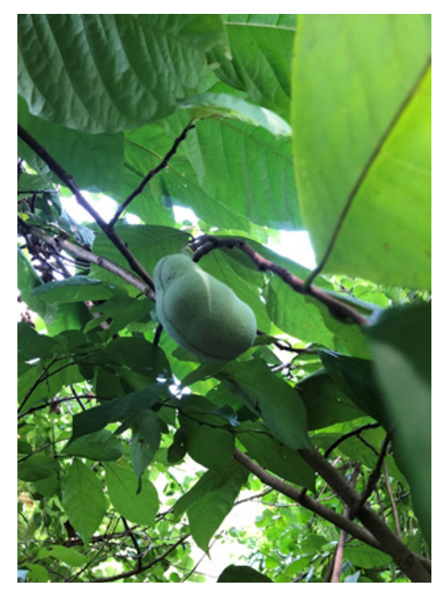
Pawpaws are setting fruit at this time of year; harvest time is September into October.