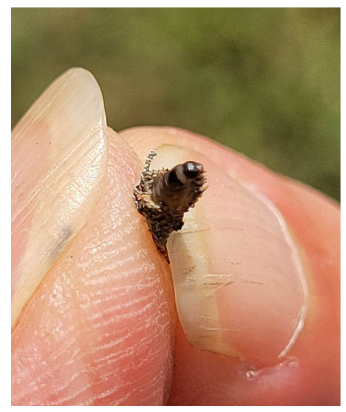
If you pull a casebearer larva off the trunk, you will see its head and legs coming out of the opening in the bag.