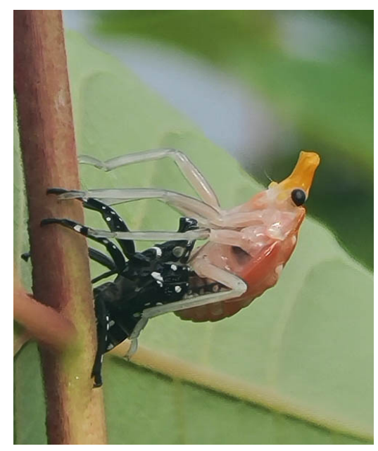
Spotted lanternfly emerging from 3rd instar to 4th instar

Several of the e-mails are from people who are noticing when you disturb the adults they leap off the plants rapidly, sometimes landing on the person closest to the infested plant. The good news is they do not bite or cause you any problems other than the alarm they set off in most people that do not want a bug landing on them. If you find a large cluster of the spotted lanternfly on a plant you can apply insecticidal soap. This is probably one of the safest control materials. In our work on this bug over the last 7 years, we have seen populations increase for 2 to 3 years and then it is common for predators and parasites to crash the populations.