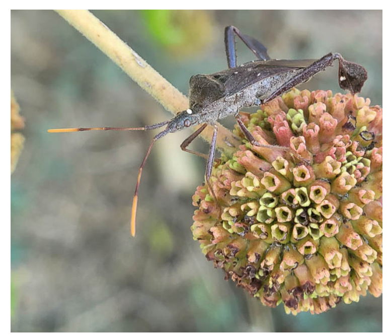
On Cephalanthus occidentalis (buttonbush), Marie found eastern leaf-footed bugs, brown marmorated stink bugs, and mantids all over the spent blooms.