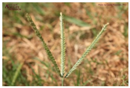
Goosegrass flower.