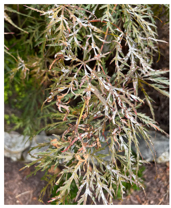
Leaf scorching damage on Japanese maple from high temperatures.