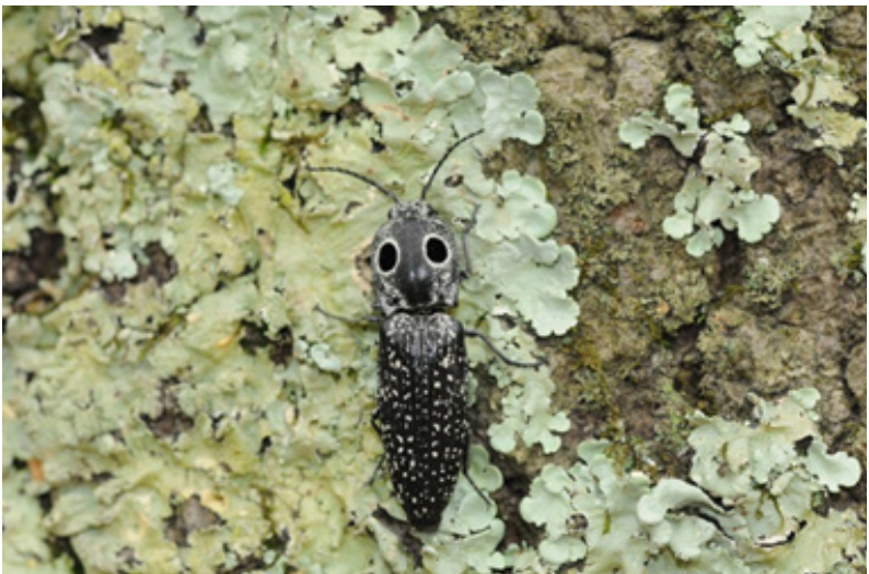
Eyed click beetles, also known as eyed elaters, are named so because of the false eye spots. They are one of the larger click beetles and are almost 2" as adults. These "eyes" intimidating to potential predators. False eye spots likely make the beetle appear larger and more intimidating to potential predators.