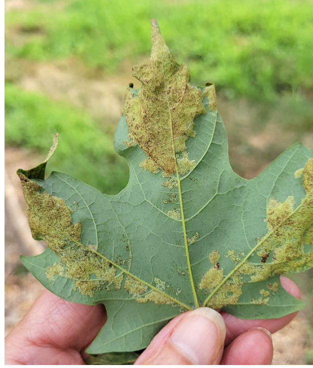
Erineum mite damage on maple leaves.