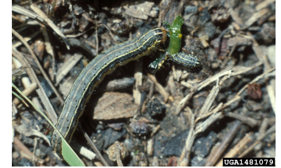
Fall armyworm larva.

Fall armyworm adult found in Virginia this