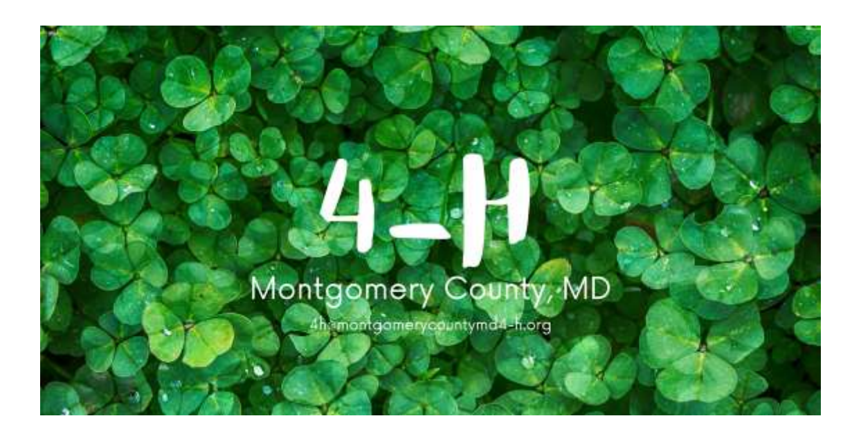
May 1, 2024