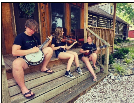
The Folk Villains