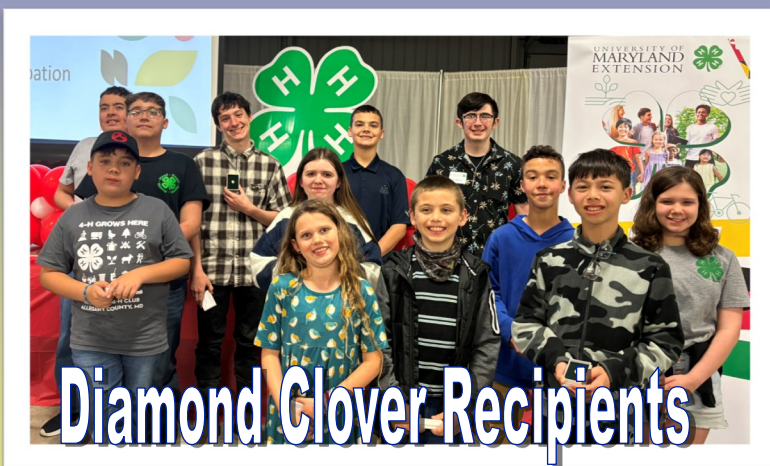
Diamond Clover Recipients