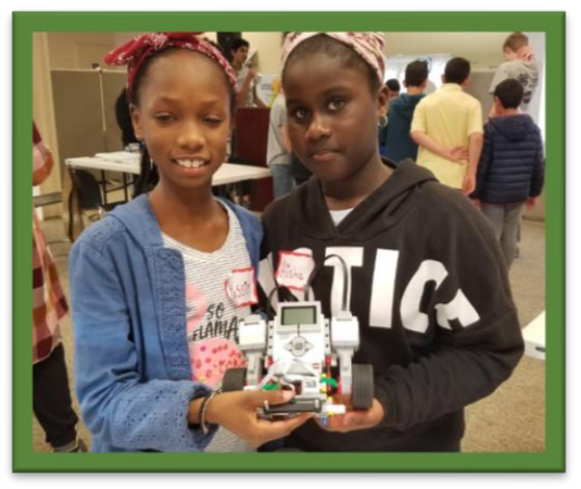
Through both competing and teaching, the Club had a very fulfilling season.

The club taught fourteen 9 to 14-year old about robotics by having them create their own competitive wrestling robot. A SuGO workshop is a 4-hour event where kids use LEGO robot kits to build and field a robot that tries to push other robots off a small playing field.