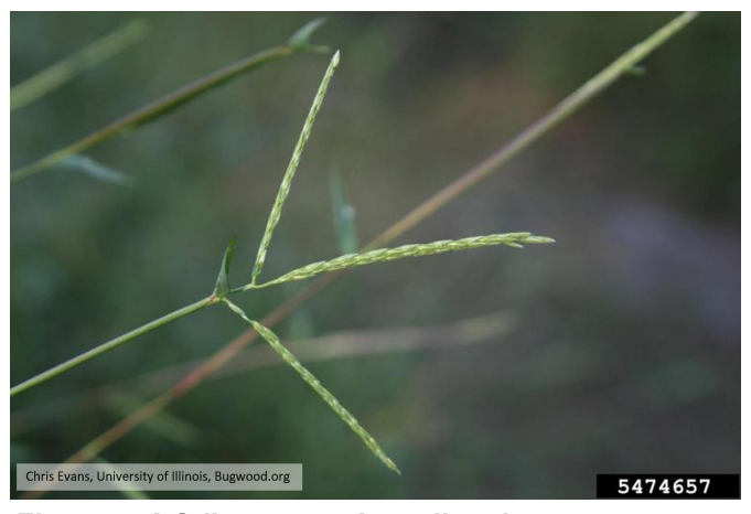
Figure 4. A fully emerged seedhead.