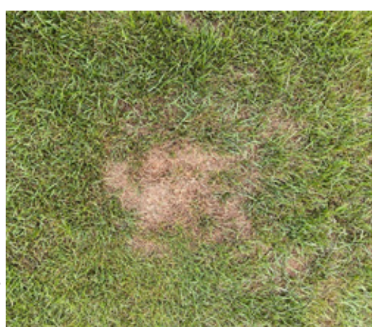
Figure 1) Summer patch symptom on Kentucky bluegrass in August.

It is that time of the year to spray for summer patch disease if you have had issues with the disease previously. This fungal disease affects turfgrass species such as annual and Kentucky bluegrass and fine fescues. While summer patch symptoms appear in the middle of the summer (Figure 1), the fungus actively grows in the spring. Proper identification of the disease is the key factor for an effective management. Once identified, fungicides are the effective tool in managing the disease; however, timing and application techniques are key to success. The best results will be obtained with spring applications when soil temperatures approach and stay at 65°F for a few days. For optimal control, plan for two to three applications at onemonth intervals. To ensure that the fungicides are effective, watered them in to reach the root system where the pathogen is attacking the plant. After applications, immediately water in the fungicide with 1/8" to 1/4" inch of irrigation. Alternatively, use a high volume of water, 5 gallons per 1,000 square feet, for applications if immediate irrigation