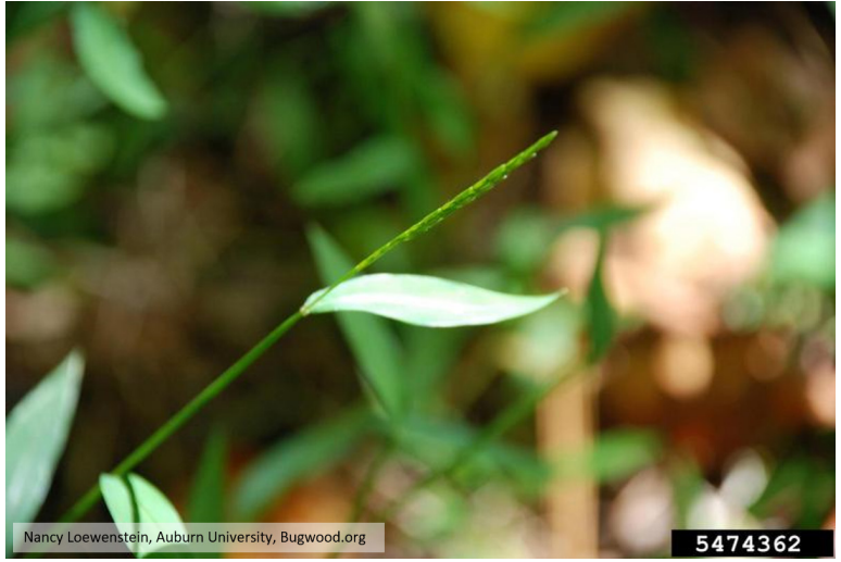
Figure 3. Japanese stiltgrass seedhead beginning to emerge.