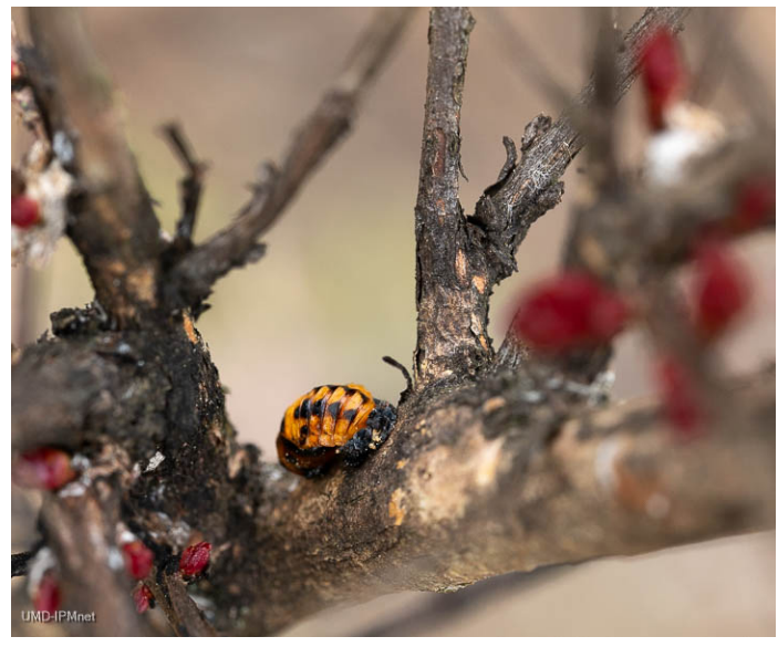
The stage of crapemyrtle bark scale as of April 19 on plant sin Ellicott City. A lady beetle pupa is among ths population. Last year, we had reports and saw activity of lady beetles, lacewings, and syrphid flies on scale populations.