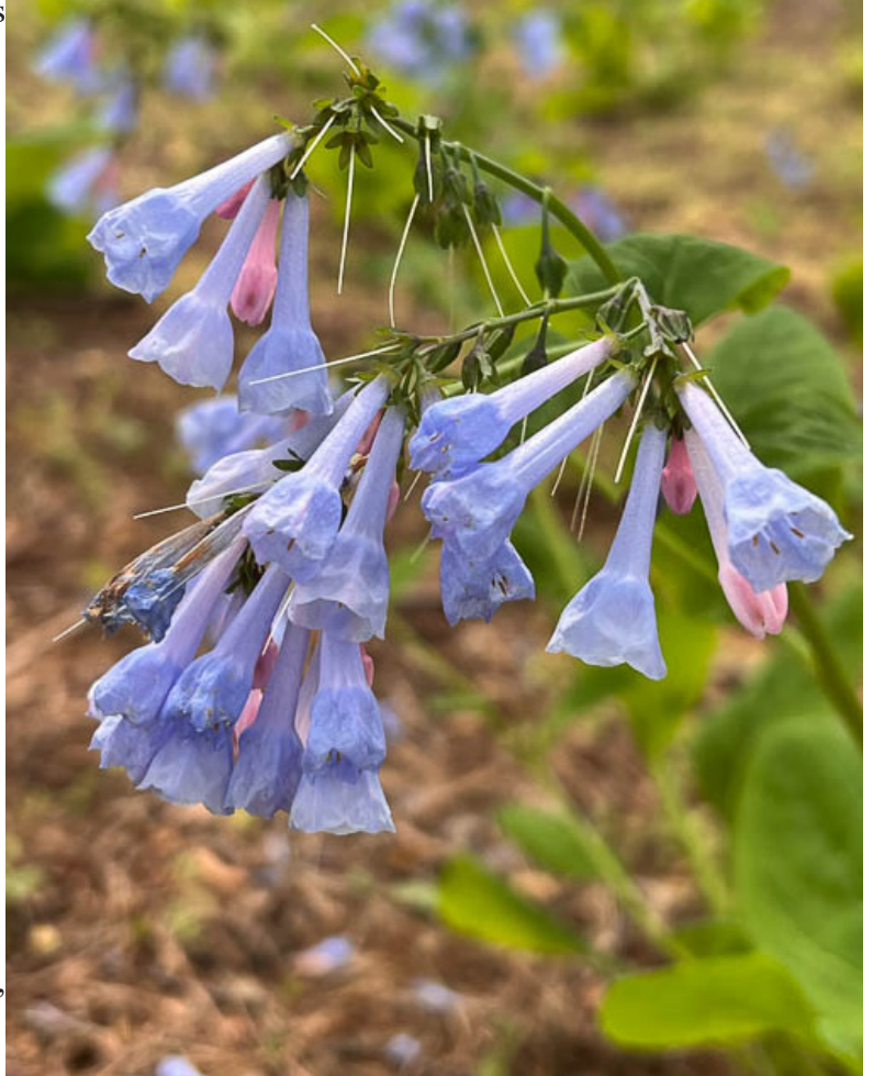
Pink buds of Virginia bluebells open into purple blue flowers.

Mertensia virginica is also called Virginia bluebells or Virginia cowslips, a lovely native herbaceous perennial that thrives in moist, rich, well-drained soils in part to full shade. They grow as clump forming erect plants 1 to 2 feet tall and 1 to 1 ½ feet wide, and depending on the site. Plants bloom from March to May, for about 3 weeks. Plants are cold tolerant in USDA zones 3-9, and have deep taproots that don't like to be disturbed. The 2-8 inch foliage is attached alternately on the stems, emerging in a deep purple color, maturing into a green blue color with a smooth, oval shape with wavey margins. The flower buds start out a soft pink that develop into a bright sky-blue trumpet shaped flower. Flowers grow to 3/4 to 1 inch long and have a delicate sweet fragrance with 5 petals that fuse together to create the trumpet. They can self-seed and colonize, filling in areas around the trees. In mid-summer the plant foliage dies to the ground and goes dormant, so they should be interplanted with other shade loving perennials like Trillium, Dicentra, ferns or shade loving annuals for summer color. While they are in bloom bumblebees, long tonged bees, butterflies, skippers, moths, flower flies, bee flies and hummingbirds will visit. Plants are resistant to rabbits, deer and Black Walnuts. There are no serious pests.