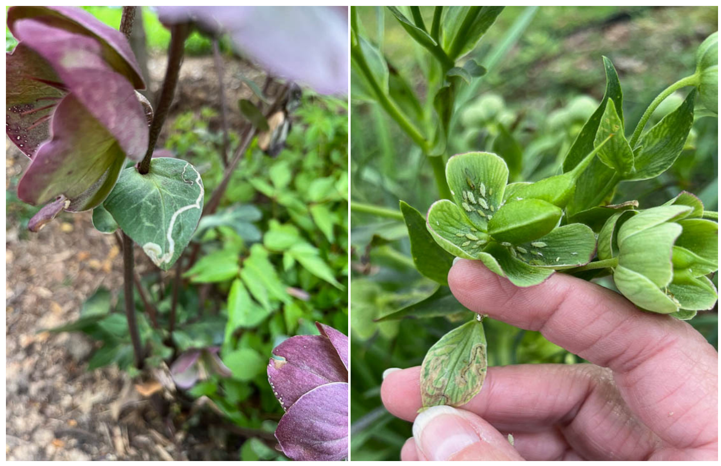
Leafminer damage is on the cultivated hellebore variety on the left; leafminer damage and aphids that are specific to hellebores are on Helleborus foetidus in the photo on the right.

Karen Rane, UMD, found hellebores in Silver Spring showing leafminer damage. Karen noted that the leafminer damage is only on the unifoliate leaves located on the flower stems - she didn't see any on the compound leaves. Karen mentioned that she hasn't seen this type of injury before and was wondering how widespread it might be. The leafminers were on cultivated varieties and Helleborus foetidus which also had aphids on it that are specific to hellebores.