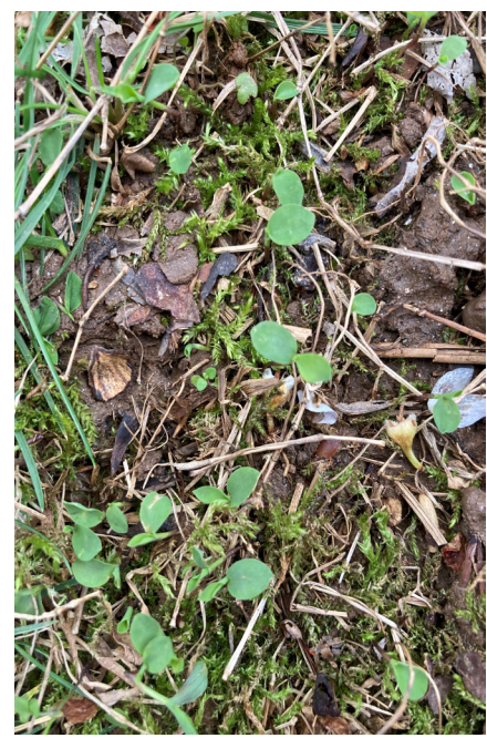
Figure 1. Japanese stiltgrass seedlings. Photo taken on April 6 near Clarksville, MD.

The one (and only one) positive thing about this invasive is that it is an annual, so there's no perennial root system to contend with. However, as an annual, stiltgrass spreads by seeds. Seedheads start to form in mid-September through October. Once they are visible (Figure 3), mow the area to prevent the seeds from maturing and becoming viable. The stiltgrass will likely not have enough time to regrow and set more seeds before the first frost. Once a control method is implemented, re-seed bare areas so they are not left for stiltgrass and other weeds to fill back in.