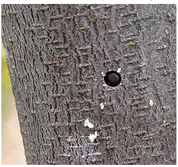
You can see the rear of the ambrosia beetle in the hole on the trunk.