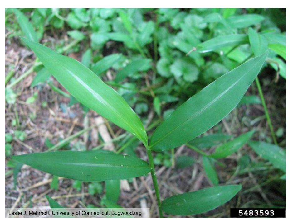
Figure 2. A silvery midvein is slightly off-center.