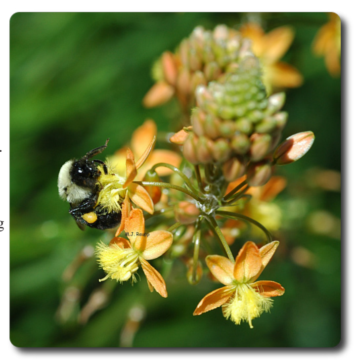
Note the pollen collected on the hind leg of this bumble bee.

This week, as I was out in a semi-wooded lot setting up a research trial and I heard this very loud buzzing sound. When I looked down, I saw a loud, busy, buzzing bumble bee. I must have seen at least 20 of these buzzing bumbles that day. The bumble bees seen (and heard) now, like in past springs, are queen bumble bees that survived the winter in holes in the ground or other protected outdoor locations. While in her overwintering location, the queen uses up most of her energy reserves to survive the winter. The first thing she does when she emerges is to drink nectar and feed on pollen from flowers to restore her energy. She can then look for a new nesting site, a place to call home. Queen bumble bees usually construct their nest in the ground in a