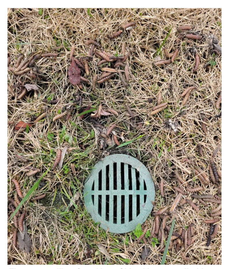
These caterpillars found in turf blend in very well with their surroundings.