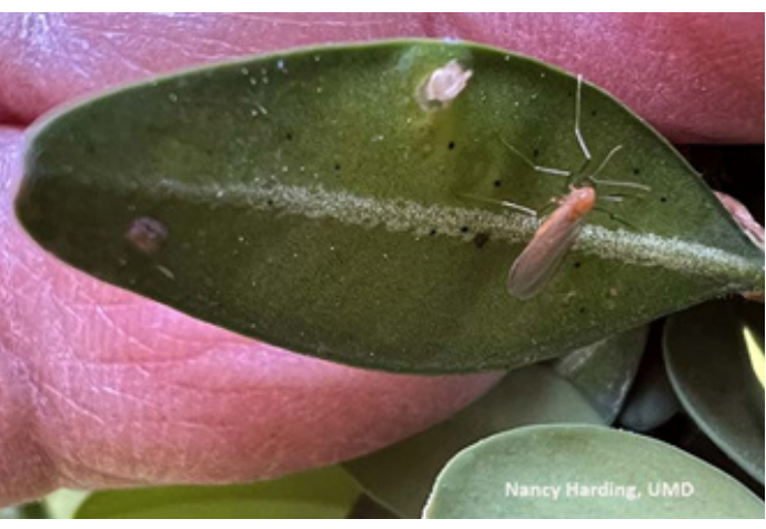
Fig. 1 Boxwood leafminer adult.

Monitoring: At this time, shake shrubs to detect flying adults and look for pupal cases on the underside of the leaves.