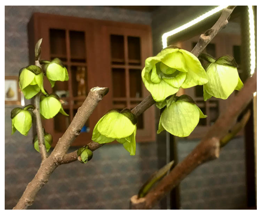
Pawpaw flowers will become purple as they mature.

Paw paws are coming into bloom this week and will be in flower for 3-4 weeks. Do not apply any pesticides at this time. They will be in flower for a long period of time and attract flies, such as syrphid flies, and beetles, including carrion beetles.