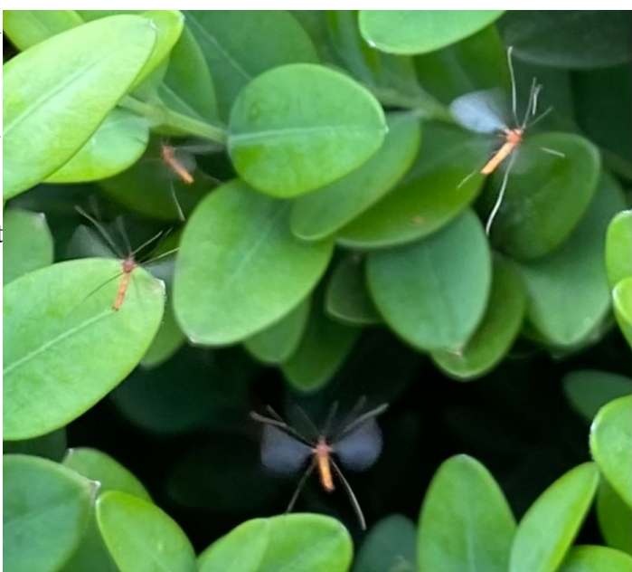
Fig. 2 Boxwood leafminer adults swarming around boxwood foliage after recently emerging as adults.

Control: Encourage natural enemies such as green lacewings and spiders. Keep plants healthy. Use boxwood cultivars that are more resistant to boxwood leafminer. Cultivars of English boxwood such as Buxus sempervirens 'Pendula,' "Suffruticosa,' 'Handworthiensis,' 'Pyramidalis,' 'Argenteo-varigata' and 'Varder Valley' are more resistant. Mechanical controls can reduce populations. Prune the foliage before adults emerge, or if they have already emerged wait until adults are done laying eggs in the leaves. If numerous mines, an application of Avid, Mainspring GNL, or a synthetic pyrethroid can be used when the adults are flying. A systemic insecticide can be applied to the soil now to target the hatching and feeding early instar larvae.