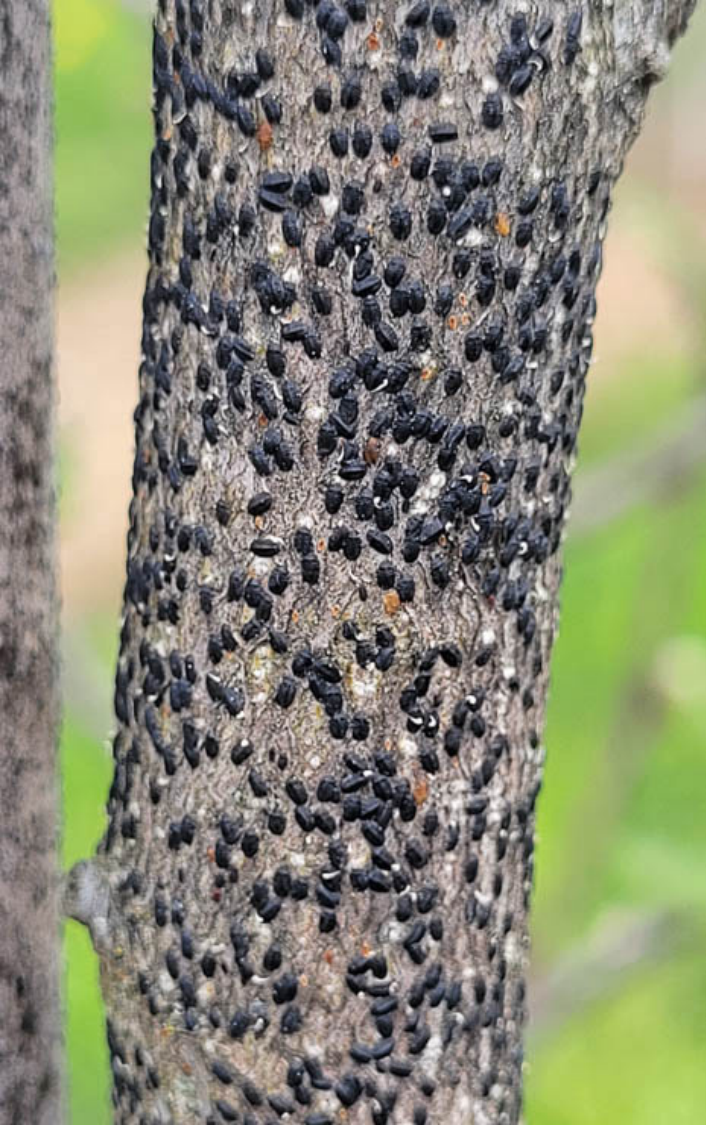
Tuliptree scale overwinters in the second instar.