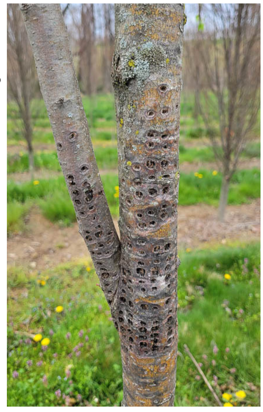
Sapsucker damage on an apple tree trunk.