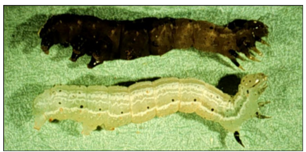
The caterpillar on the top is infected with Bacillus thuringiensis kurstaki and the bottom caterpillar is not.

It is nice to have a bio-insecticide "tool" in the pest management tool box for managing caterpillars, especially one that is caterpillar specific and less toxic to non-targets such as other natural enemies that also help to keep caterpillar populations from outbreaking.