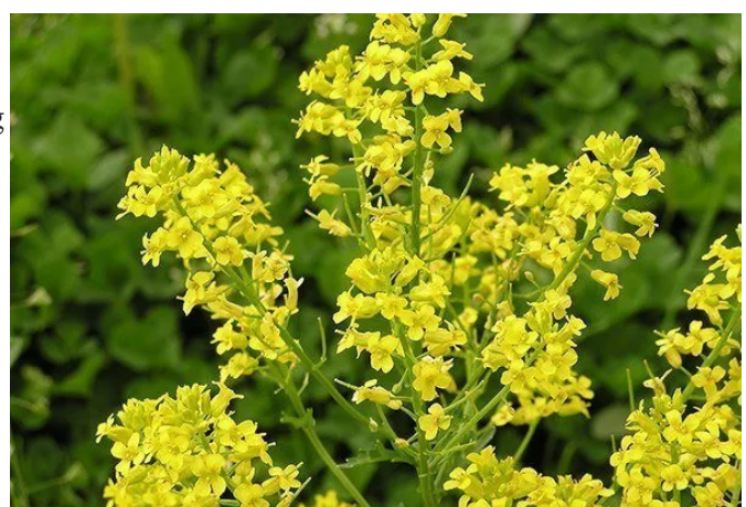
Seeds of yellow rocket can persist in the soil for many years.