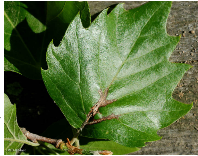
Sycamore anthracnose infection.

In general, anthracnose diseases are often minor and reduce the aesthetic value of infected trees. Young recently transplanted trees are more susceptible to lasting damage while older, established trees typically suffer only minor growth losses. Healthy trees that are defoliated early in the growing season are often able to flush a new set of foliage and recover.