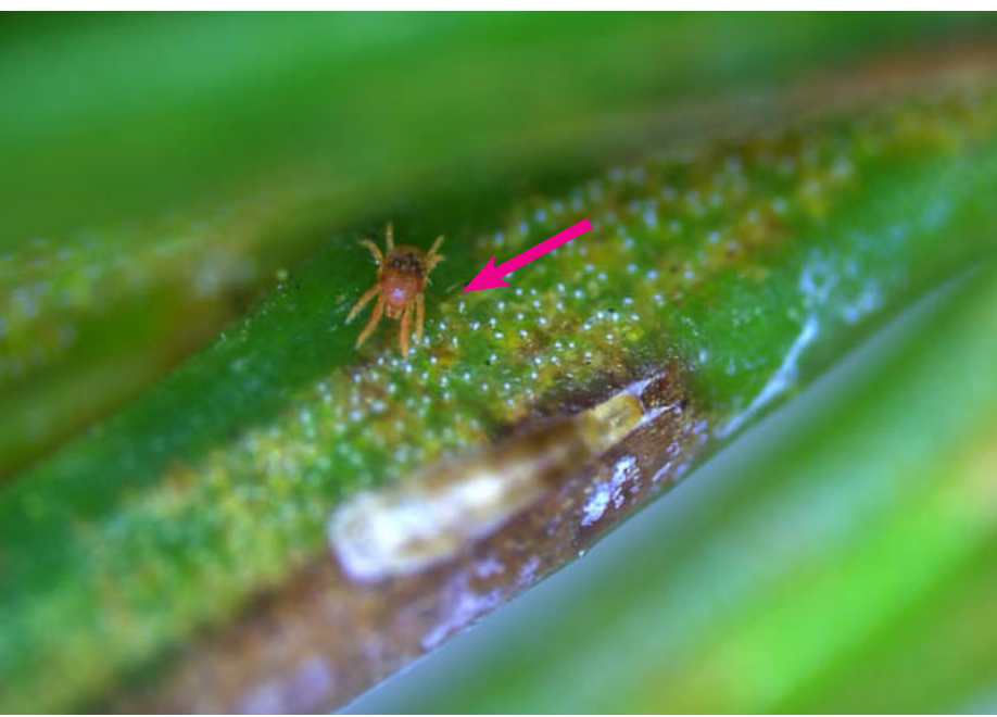
Spruce spider mites were found on cryptomeria in Gaithersburg. (There is also a Maskell scale cover in the photo)

Degree days are starting to accumulate quickly with the warming weather this week. Reaching the predicted degree day level soon in many parts of the state, one of the mites that will be out very shortly is the spruce spider mite. Today, we received the first report of spruce spider mites. Heather Zindash, The Soulful Gardener, found them on cryptomeria in Gaithersburg. It overwinters as eggs and the protonymphs will be hatching soon. An excellent mite growth regulator we have used on this mite is Hexygon. TerraSan would also work as a mite growth regulator. Both of these products are ovicidal and control proto and deutonymphs stages. In our trials, we found 10 -14 days of activity against mites. Since new growth has not started on most junipers, Leyland cypress, and