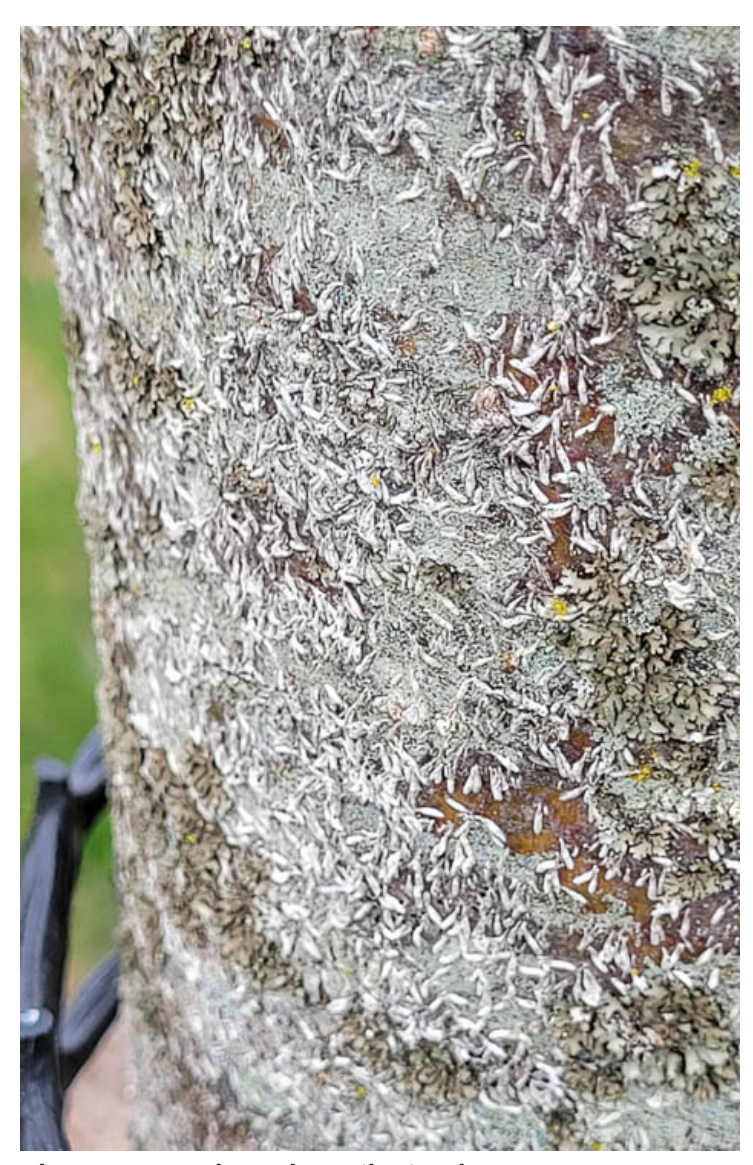
Japanese maple scale on the trunk.

Distance or Talus can be used when crawlers are active.