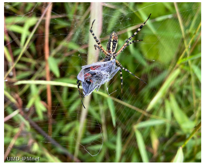
An Argiope spider is feeding on an SLF adult.