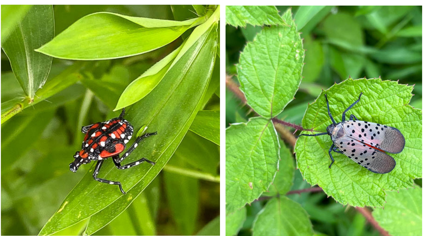
The fourth instar nymph of the spotted lanternfly is red with black areas and white spots.(7/7/22) The adult is the winged form in the photo on the right. (7/26/22) The movement of the spotted wings will reveal a bright flash of red on the body.