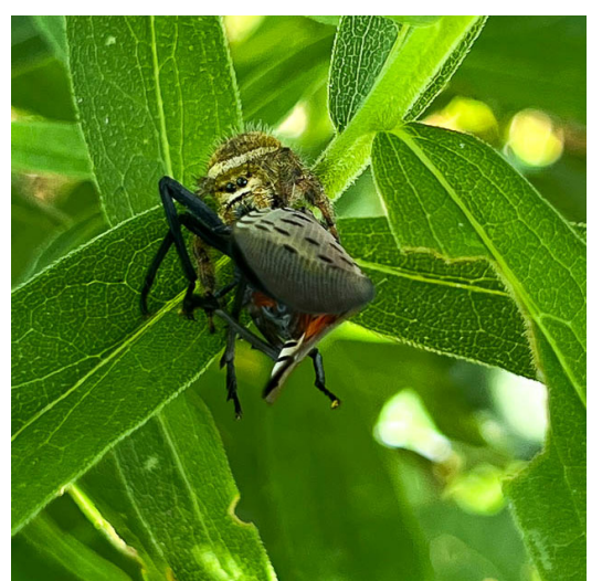
A spider feeding on an SLF adult.