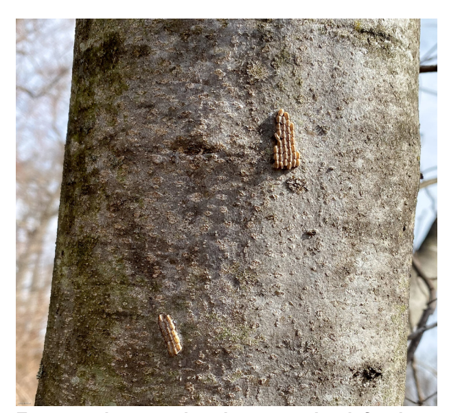
Eggs are the overwintering stage. Look for the tan egg masses on trunks and branches. 3/8/22