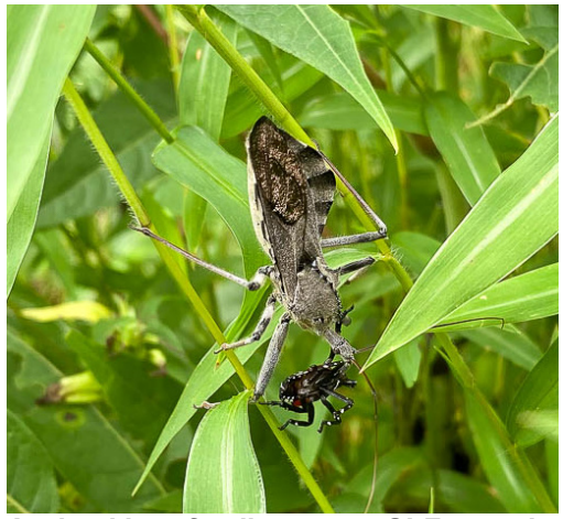
A wheel bug feeding on an SLF nymph.