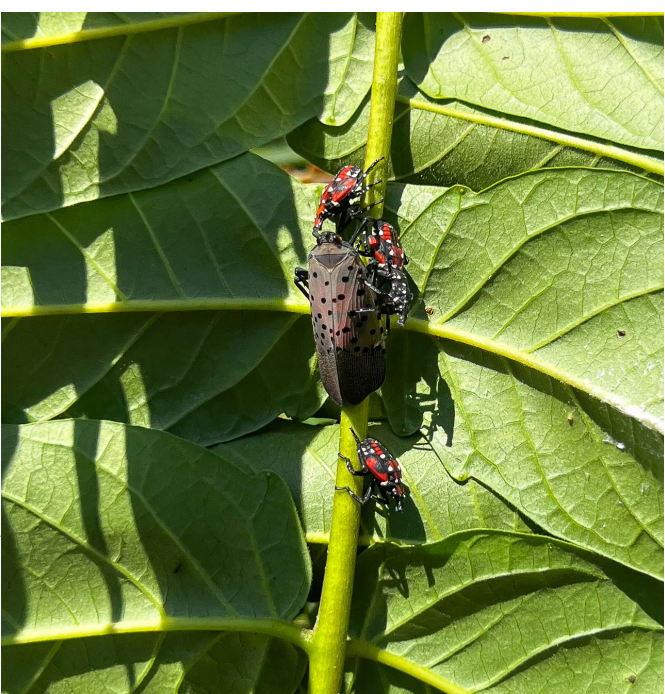
An SLF and several fourth instar nymphs.(7/19/22)

If you are considering insecticides to manage SLF nymphs, there are a few things to consider. First, be conscious of bloom times and select pesticides with the least likelihood of non-target impacts. Also remember that SLF early instar nymphs will likely move from the tree / location they hatched on to other host plants such as roses (both cultivated and multi-flora), many perennial plants, and possibly grapes, tree-of-heaven, and walnuts; while later 4th instar nymphs and adults move onto a wider range of tree species later in the season. At this time to target the early instar nymphs (1st – 3rds), you should use contact insecticides such as insecticidal soap, neem oil, horticultural oil, or natural pyrethrins. Synthetic pyrethroids have been shown