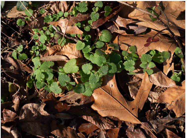
Deadnettle is growing around the research center in Ellicott City on February 21st.

Daikon radish is stll green in Central MD this week. It should have died back by now.