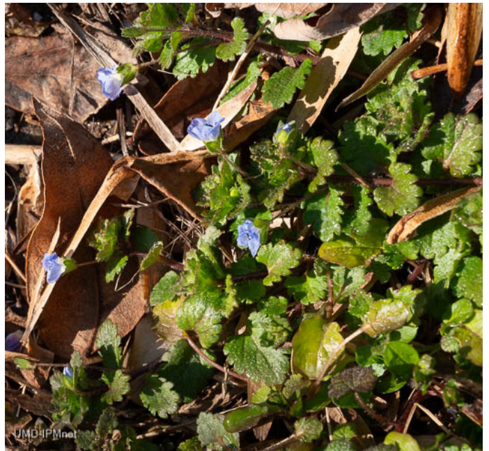
Speedwell is blooming at the research center in Ellicott City as of February 21st.

It reached 61 °F on February 9 and the cool season weeds are rejoicing. We are seeing all of the cool season weeds that germinated last fall greening up rapidly and they will be ready to go as soon as the weather stays warm for longer periods in March and April. On Monday, February 26, it's supposed to go back up to 60 °F. Be prepared for a strong weed crop in 2024.