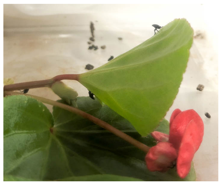
Spotted lanternfly eggs were used as a sample at the December 8, 2023 IPM conference. Kept inside, recently hatched nymphs were found this week.

I was going to toss the container since it had gotten moldy, but noticed there were some first-instar SLF running around, which must have just hatched recently since very few were dead from presumed starvation on the bottom of the container. Our office wasn't always at room temperature, but definitely was well above any "chill hours" you would think the insects would have needed. I suppose they received all the chilling they needed by early December, which is surprising!