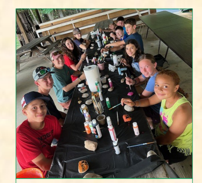
Rabbit Raisers 4-H Club working on club entries