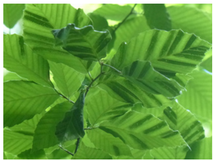
Fig. 1. Dark "stripes" on leaves of beech, typical symptoms of Beech Leaf Disease.

To report trees with suspected beech leaf disease, contact MDA Forest Pest Management at 410-841-5922 https://mda.maryland.gov/plants-pests/pages/forest_pest_management.aspx