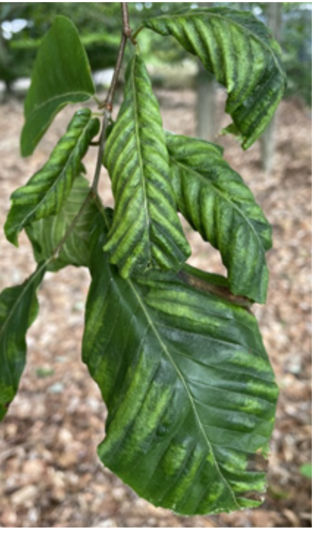
Leaf distortion and curling due to beech leaf disease.