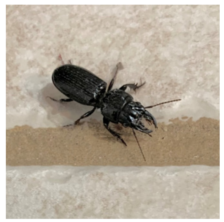
Big-headed ground beetle ( Scarites subterraneus ) adults feed on a diversity of other insects, snails, and slugs, and some plant material providing biological control services.

Ground beetles are common and abundant in our landscapes and nurseries in addition to many other managed and natural environments. Ground beetles get their name because most species forage and live at the ground level (click here to see video). However, there are a few species, such as the fiery hunter beetle ( Calosoma sp.), that are arboreal. I commonly see fiery