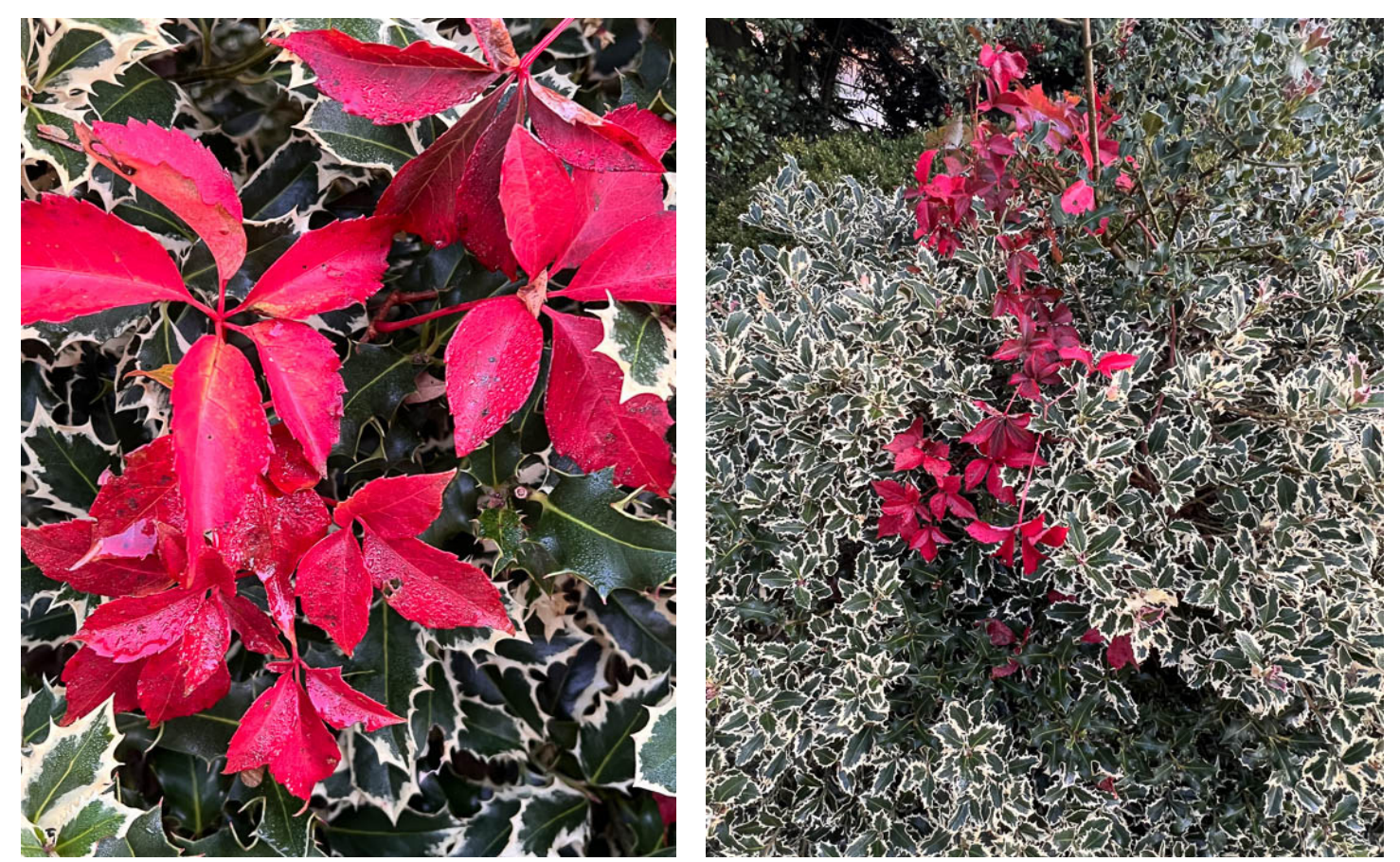
Virginia creeper. Parthenocissus quinquefolia var. englemannii . showing off its bright fall color.