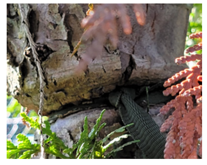
Fig. 2. Close up of trunks from two of the arborvitaes with top dieback, revealing the support straps embedded in and girdling the trunks.