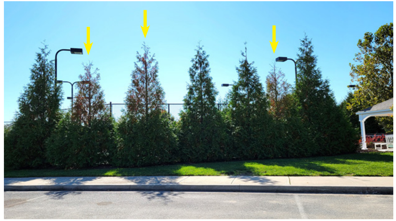
Fig. 1. Row of arborvitaes showing discoloration and dieback on some of the plants (arrows).

Joe Seamone of McCall and Berry Landscape Management sent in photos of a planting of arborvitaes showing top dieback symptoms on some of the plants (Fig. 1). There are a number of problems that can cause dieback in arborvitaes – abiotic root stress issues, root injury from construction, fungal canker diseases and insect borers are just a few. In this case, a closer look at the trunk of the affected plants revealed the cause for the symptoms – Joe discovered that nylon straps used to support the plants at planting several years ago had not been removed, and were girdling the trunks (Fig. 2). It's important to examine trees and shrubs closely and thoroughly as part of the diagnostic process.