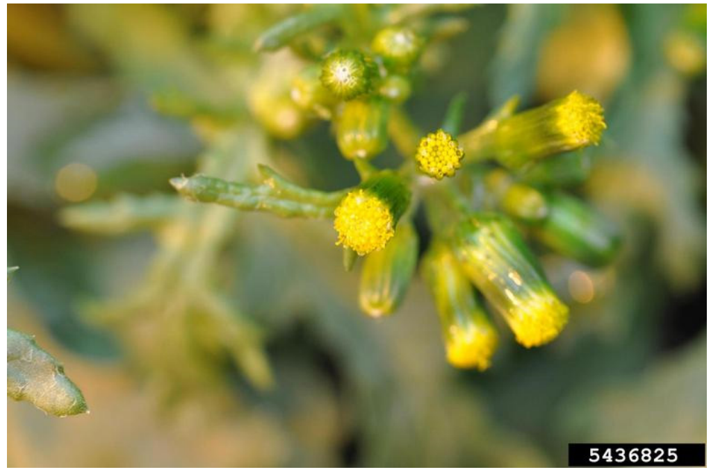
Common groundsel

Cultural control of common groundsel will include reducing fertilizer placement near the surface of landscape beds, not placing fertilizer on the surface of container grown plants, and growing dense turf. Some biological controls have been researched in California using ragwort flea beetle and cinnabar moth larva with some amount of success. Chemical control of common groundsel is achieved using many pre-emergent products that will include snapshot and Surflan, Snapshot, Rout, and Gallery in the landscape, and in container nursery crops the use of Broadstar and Rout provide control in reducing common groundsel by up to 90%. Timing is very important as this can be a fall germinating weed. Post emergent control can be obtained using glyphosate products. Control in turf settings can be achieved using many broadleaf post-emergent products.