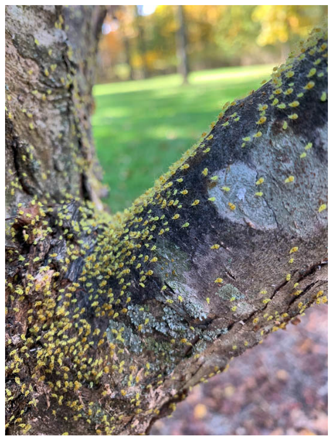
Giant bark aphids are often found in the fall.