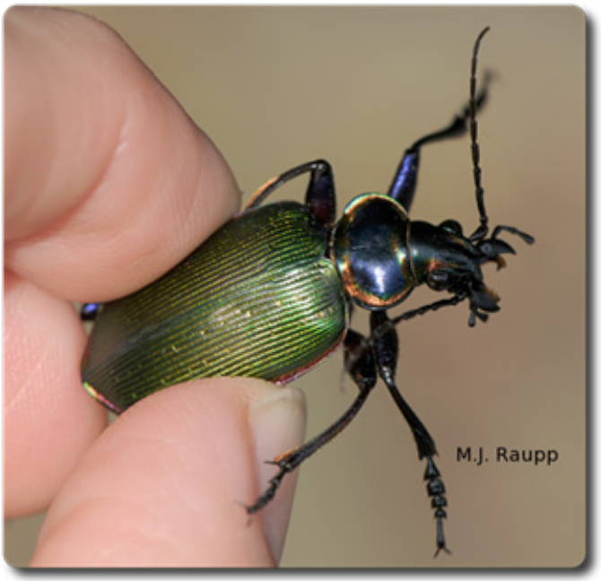
The fiery hunter, Calosoma scrutator , is one of the largest carabid or ground beetles growing to 1.5" long. Their ability to run up trees and large mandibles, make them excellent predators of caterpillars.

their potential for providing pest insect and weed suppression. These practices will also increase the abundance and diversity of numerous natural enemies, especially those that are generalist feeders.