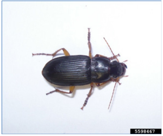
Pennsylvania dingy ground beetle, Harpalus pensylvanicus , adults are active August and September, consume seeds from weed plants, and provide weed biological control.

Because ground beetles are good biological control agents of potential pest insects and weeds, and they have diverse diet preferences, a number of studies have examined methods to enhance ground beetle populations by modifying managed environments to be more favorable for ground beetles – an approach referred to as conservation biological control. Studies have shown that installing "beetle banks" (rows of bunch type grasses between crop rows) in agricultural fields enhances populations of ground beetles, with the grasses providing refuge and overwintering habitat. Production nurseries often install grass allies between plant rows, which should favor ground beetles. Container plant producers can put hard wood mulch over weed cloth beds. Our research has shown that this will increase prey item abundance (ex. collembola breaking down the mulch), provide habitat (nooks and crannies from the mulch) and increase ground beetle activity. It would be hard to go wrong trying to encourage a diverse and abundant population of ground beetles with