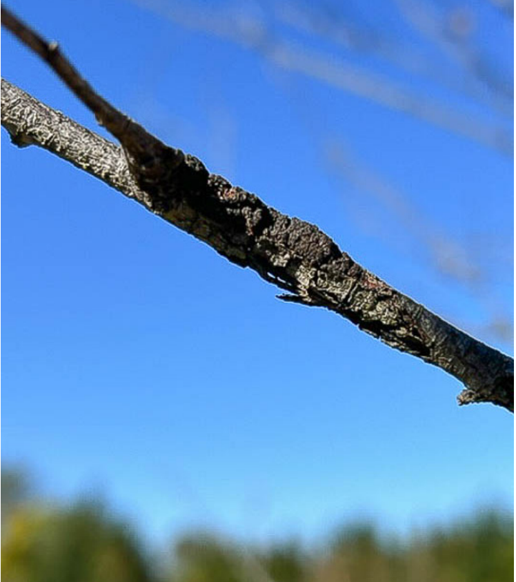
As the leaves drop from the trees, black knot galls are easy to find.

At this time of the year, the only good solution is pruning out the galls. Preventative fungicides such as chlorothalonil or Manzate need to be applied starting early in the growing season to mid-season to prevent future galls from forming.